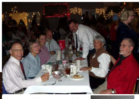
This year's Holiday Dinner provided an excellent opportunity to visit with friends from previous years.