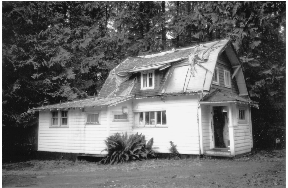
Figure 2: Deteriorated Park Service Structure Used by Nonprofit Association at Olympic National Park

conditions, including fire risks. The building's roof, siding, and foundation were in serious disrepair, and the interior ceiling was sagging severely. Inside the structure, electrical cords were hanging over and through furnishings, and rainwater dripped through the roof onto interior furnishings. The building did not have any fire detection or sprinkler systems, even though flammable paper storage boxes were strewn throughout the structure. According to several park officials, the condition of the building's exterior and interior posed serious fire risks to its inhabitants. The acting fire chief of a nearby city's fire department told us that the building would have been condemned for human habitation if the structure were within the city's jurisdiction.