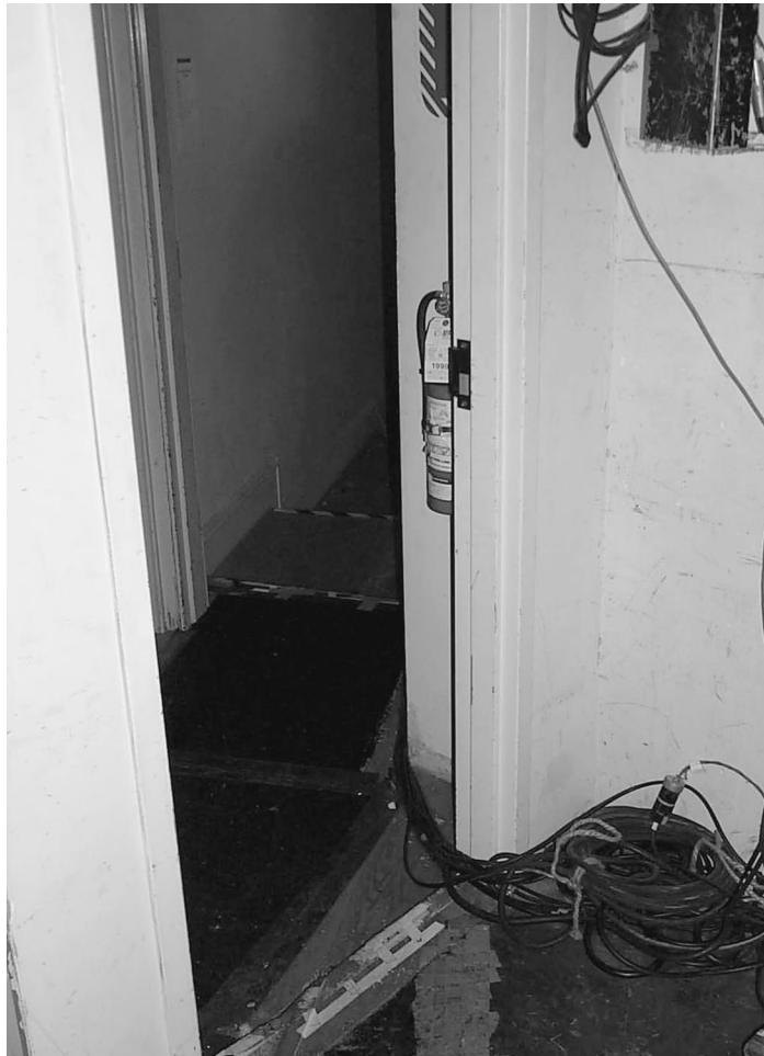
Figure 3: Wires Running Under Stage Fire Door of Ford’s Theatre

The remaining key element in fire prevention and protection, according to the structural fire safety experts we contacted, is the submission of data on structural fire incidents to a national database to analyze fire trends and causes so that corrective measures can be devised and initiated. Three of the six parks we visited did not participate in an agencywide fire incident reporting system. Failure to report this kind of information undermines the agency’s ability to understand the scope of fire problems and vulnerabilities