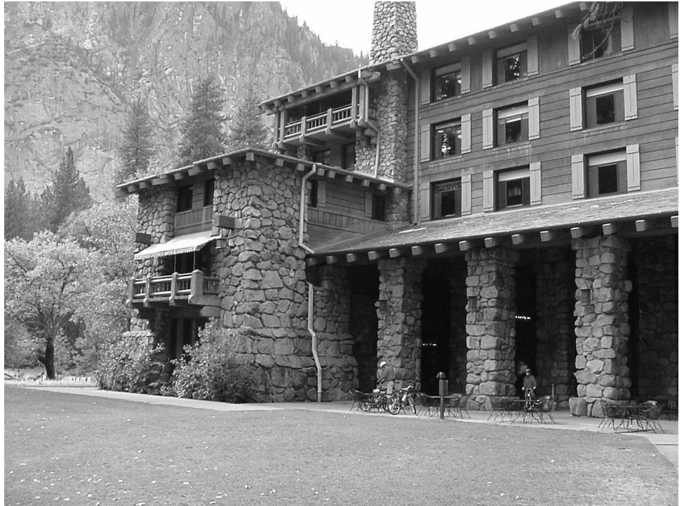
Figure 5: The Ahwahnee Hotel in Yosemite National Park