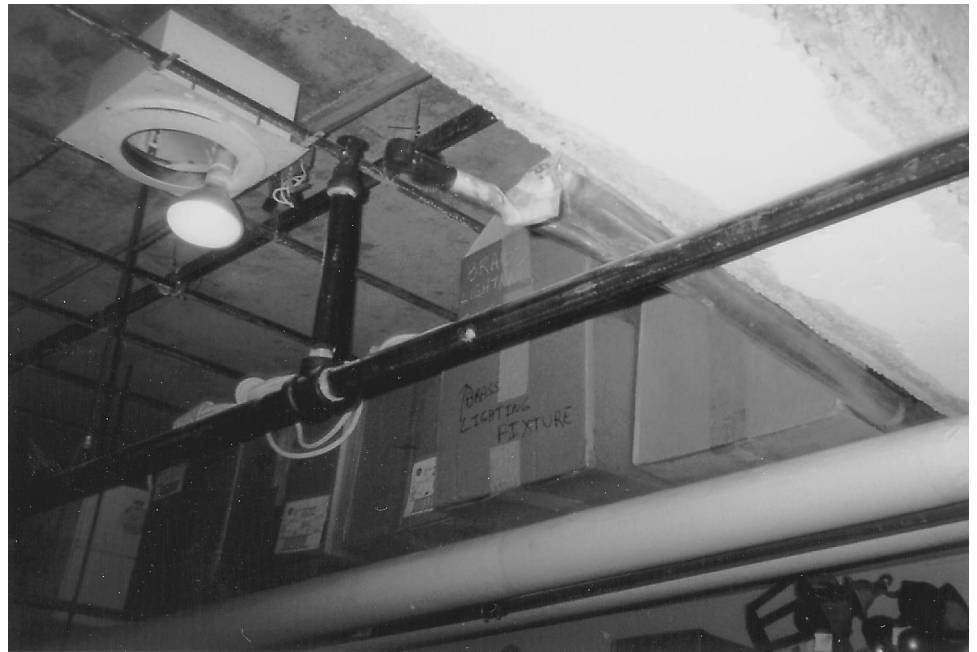
Figure 4: Boxes Impeding Effectiveness of Fire Sprinkler in Storage Area of Theatre's Basement