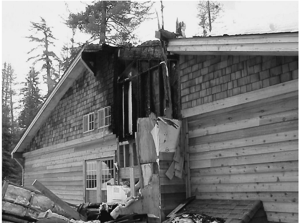
Figure 1: Fire Damage at New Hotel in Sequoia-Kings Canyon National Park

This report analyzes the Park Service's efforts to prevent and respond to fires in the many structures (structural fires) in the national park system. It does not address the agency's efforts to respond to wildland fires. Concerned about the effectiveness of the Park Service's efforts to protect human life and property, you asked us to review parks' structural fire safety efforts. As agreed with your office, our work focused on answering the following questions: