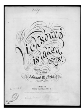
Vicksburg is taken, boys

Map of the rebel position at Vicksburg, Miss., May 1863. Map. c1863-1865. Civil War Maps. American Memory. Library of Congress. <a href="http://memory.loc.gov/cgibin/query/r?ammem/gmd:@filreq(@field(NUMBER+@band(gvhs01+vhs00140))+@field(COLLID+cwmap)">http://memory.loc.gov/cgibin/query/r?ammem/gmd:@filreq(@field(NUMBER+@band(gvhs01+vhs00140))+@field(COLLID+cwmap))>.