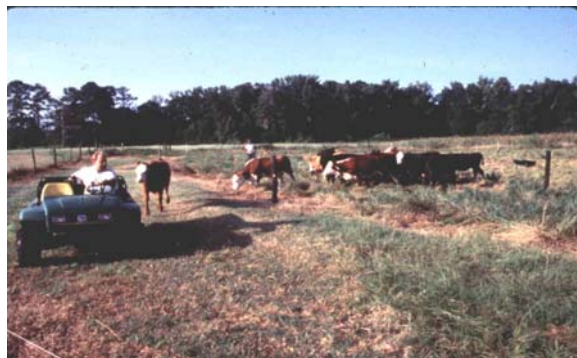
After each grazing period cattle were moved to a new paddock