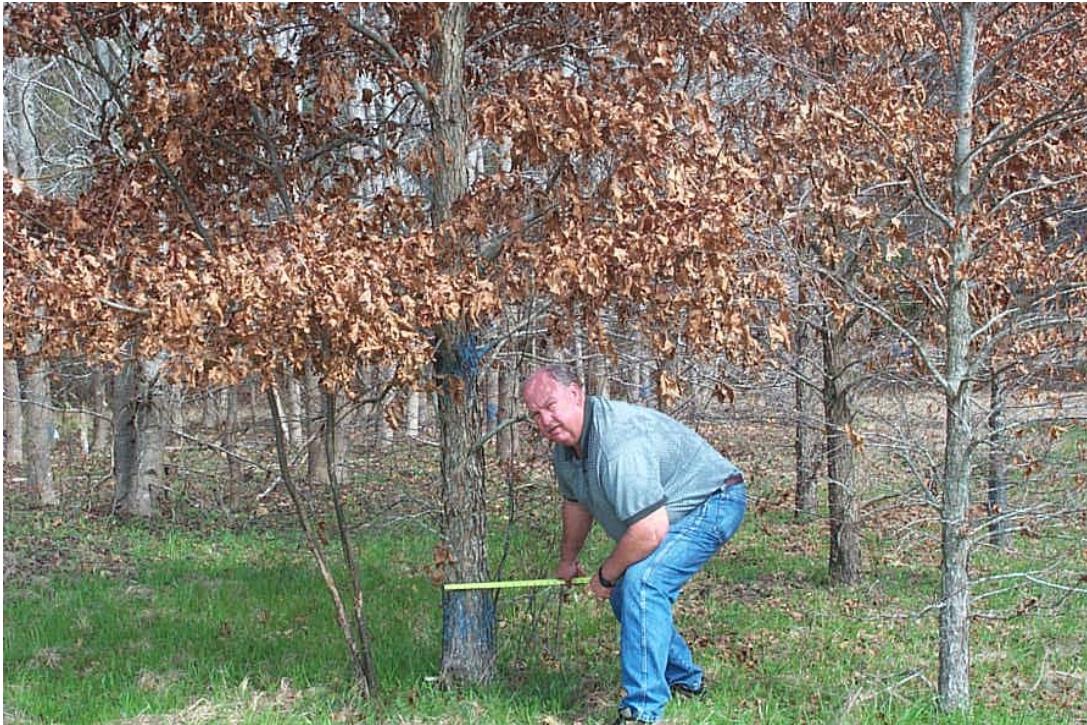
Forest Buffer Evaluation Area at Jimmy Carter PMC White Oak (Above)