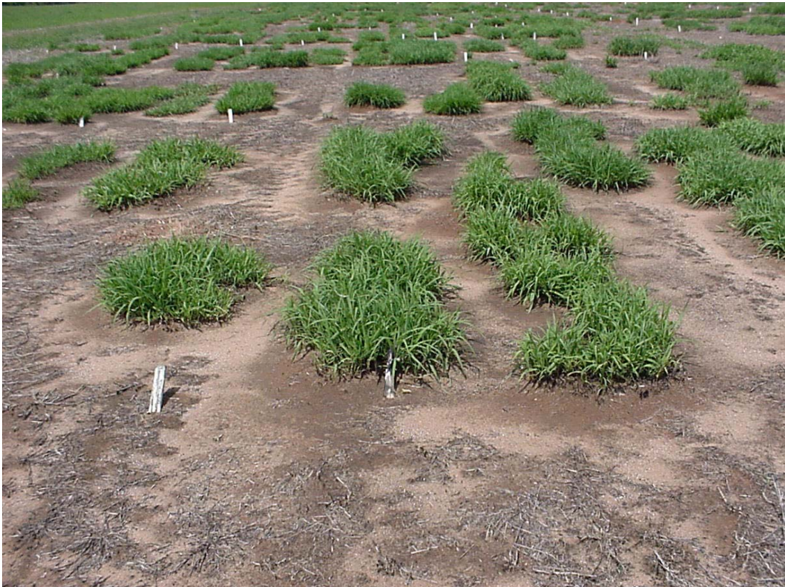
Spring growth of Big bluestem by March 31 at PMC Big bluestem nursery

Subsequent seed harvest will be initially used for comparative forage testing.