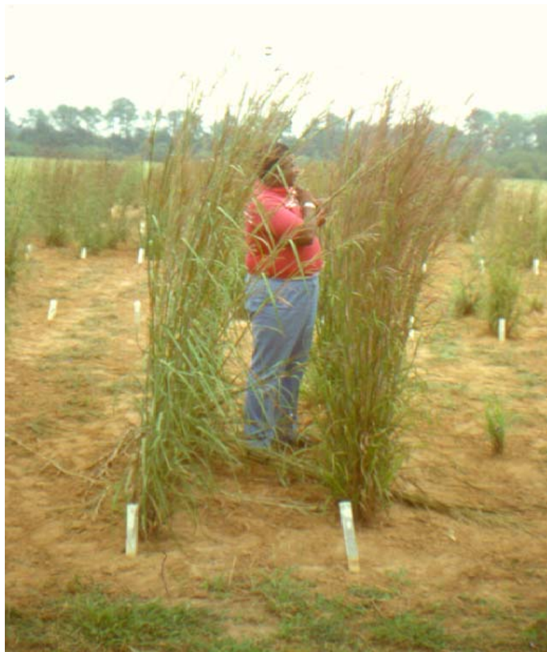
Big Bluestem initial evaluation area