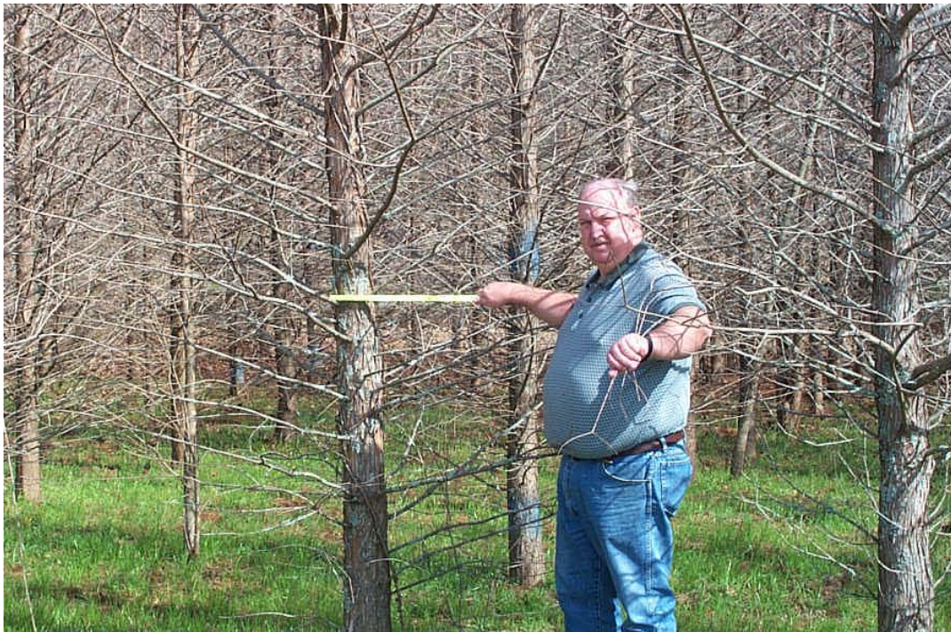
Forest Buffer Evaluation Area at Jimmy Carter PMC