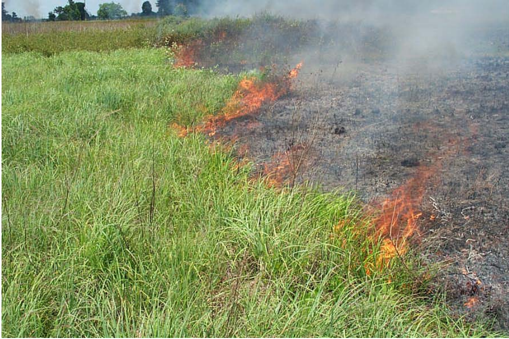
Growing season burn conducted May 25, 2004