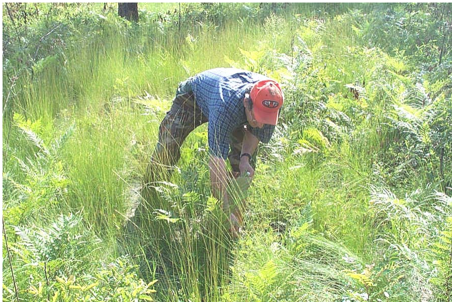
Seed Collection in Worth County Georgia