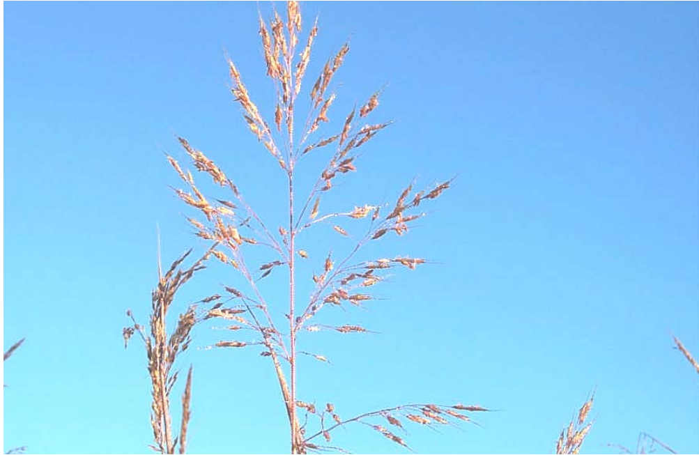
Newberry Germplasm Indiangrass