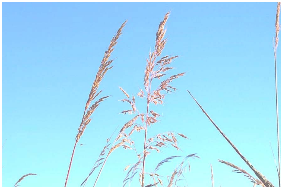
NEWBERRY GERMPLASM INDIANGRASS

A Technical Summary of Plant Materials Studies At the Jimmy Carter Plant Materials Center Americus, Georgia