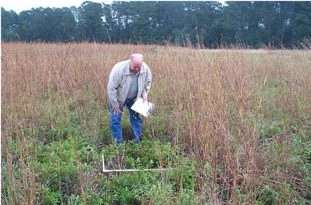
Data collection from burn plots in 2004