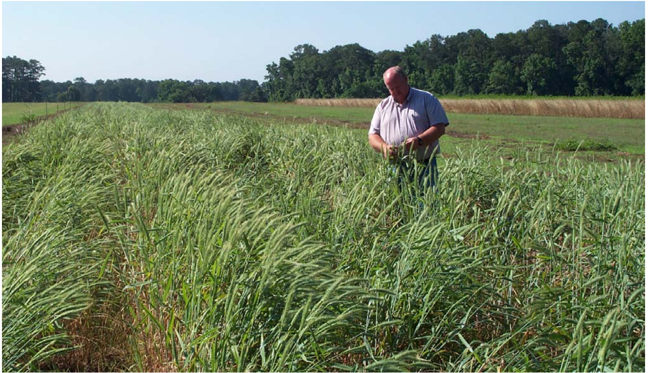
Kinchafoonee Virginia Wildrye Selected Class of Natural Germplasm at Jimmy Carter PMC