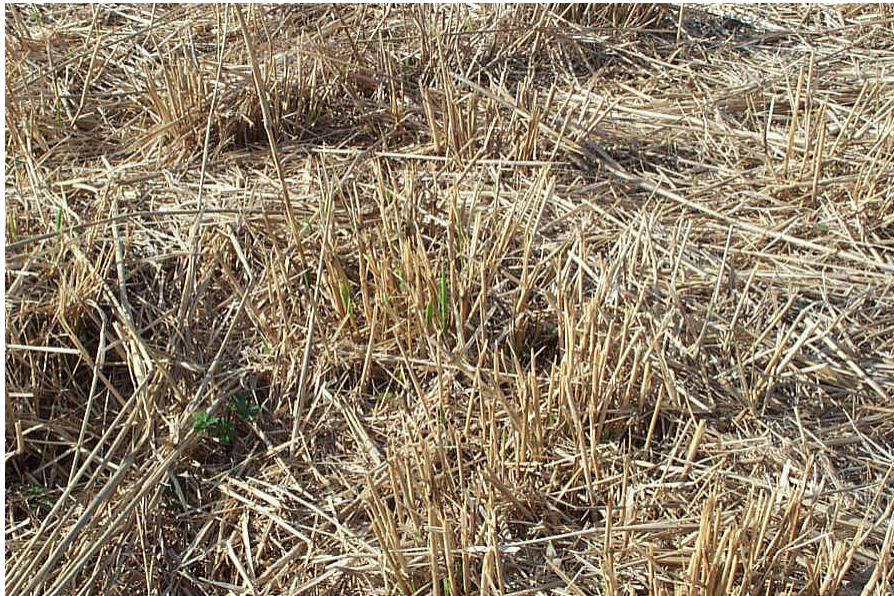
End of Season Organic Matter Production of Alamo Plot in 2004