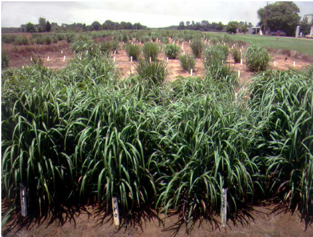
Durham Germplasm Switchgrass