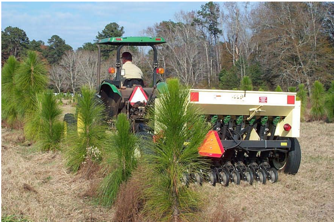
Dixie Crimson Clover being planted for additional study evaluation in 2004