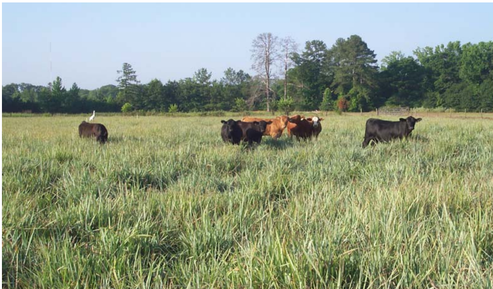
Cattle grazing ' Americus ' indiangrass field

Additional rotational grazing of the indiangrass is planned for future years when needed to supplement other grazing studies.