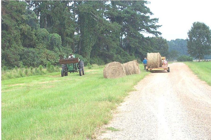
Hay production from Silvopasture project