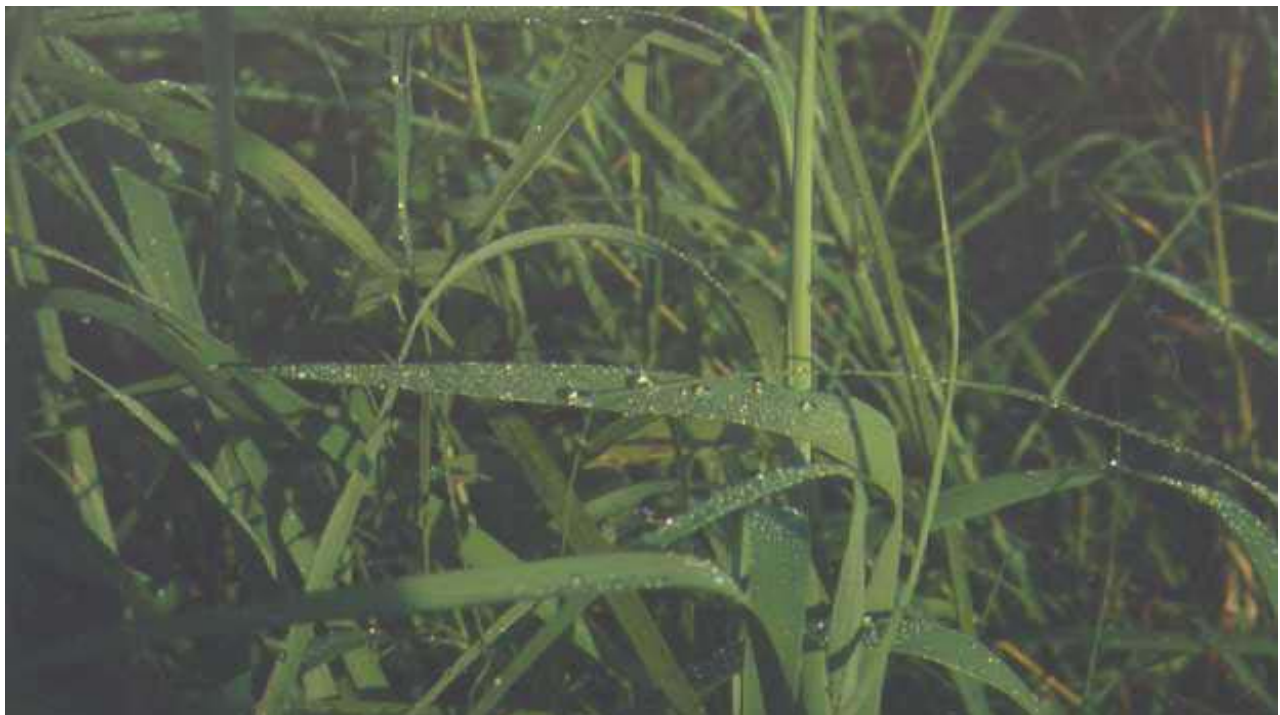
Union Germplasm Switchgrass