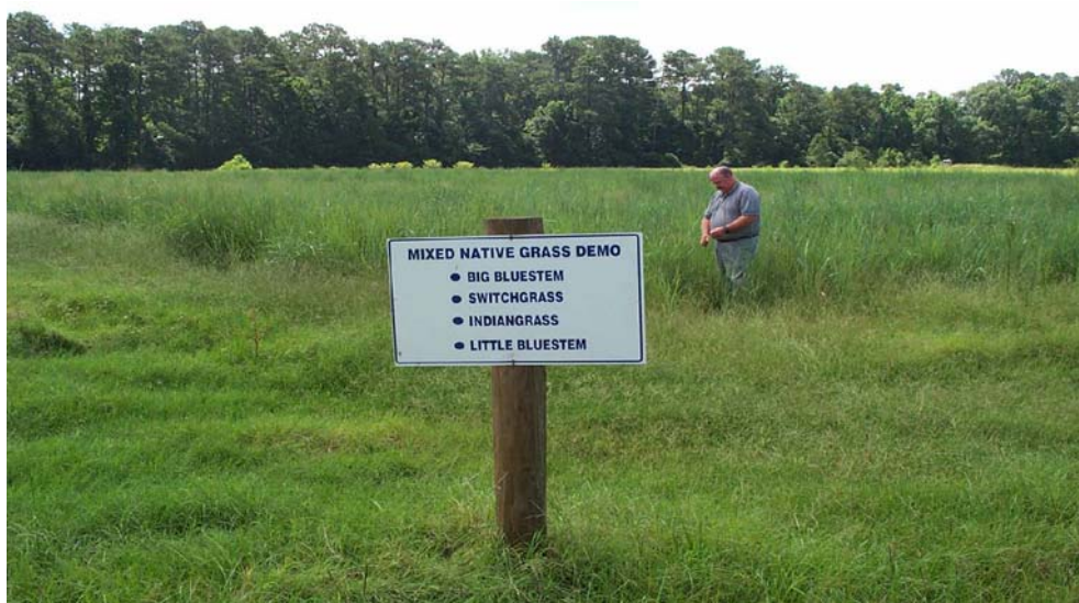
Native Mixed Grass Pasture in Southeast Corner of Plant Materials Center

Alamo appears to have reached a plateau, Cave in Rock and Earl are continuing to increase while Americus and Little bluestem rose in % in 2004. Future transects will be conducted to monitor changes in species composition of the mixture over time.