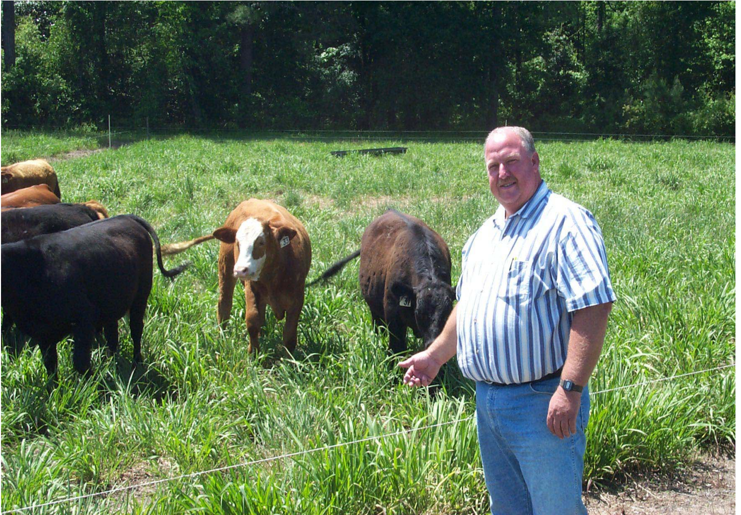
Lamar County S&WCD cattle grazing paddocks