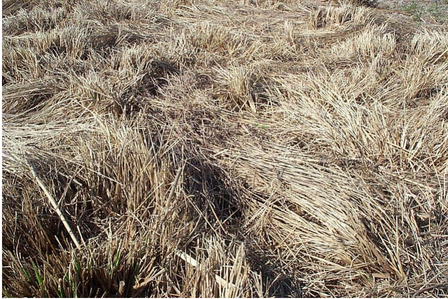
End of Season Organic Matter Production of Iuka Plot in 2004