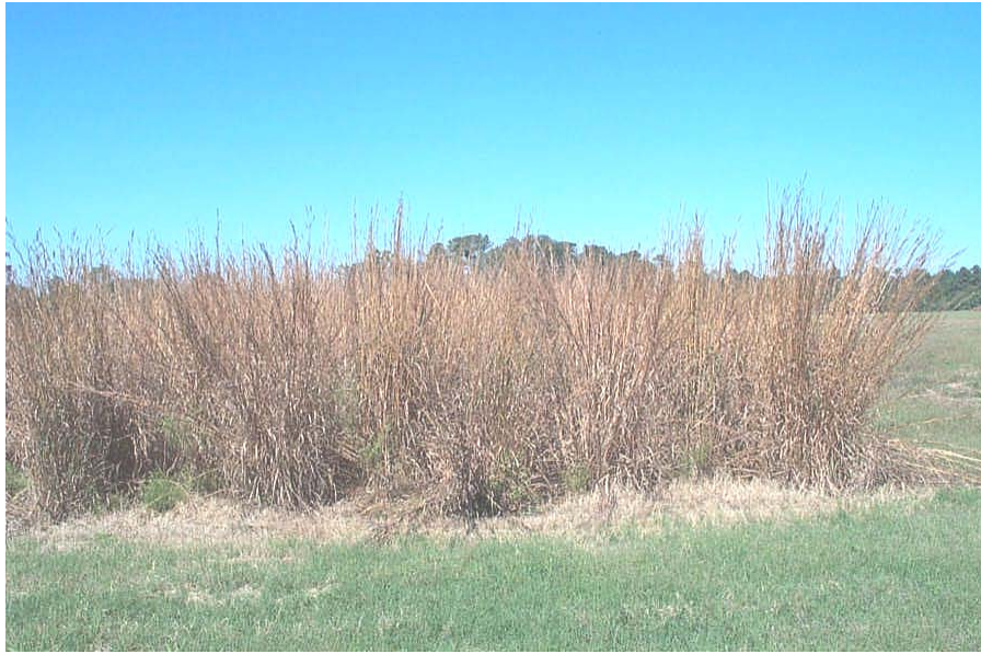
Big bluestem forage type crossing block in September prior to harvest