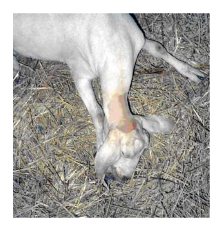
Figure 2. Swollen knee joints and paralysis, typical of a goat affected by CAEV.

become progressively worse. The knee joints or carpal joints will become distended. Goats will lose body condition and develop a rough hair coat, which may be due in part to decreased competitiveness at the feed bunk. Labored breathing due to pneumonia may be present in both mature goats and kids. The mastitis is referred to as "indurative mastitis" due to the deposition of vast quantities of connective tissue in the udder as part of the immune response. During and after the kidding period, the udder will be firm and swollen, hence the term "hard udder." Milk production will be low or completely absent. In a recent study of CAEV infection in a Passeirer Gebirgsziege goat herd in Germany, weight loss was one of the most common signs.