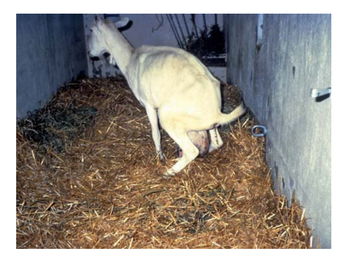
Figure 1. Could the weight loss and rear limb weakness in this goat be due to CAEV?