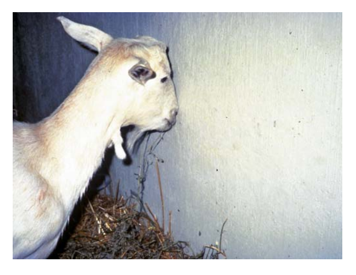
Figure 3. A young goat pressing its head against the wall, typical of a kid with encephalomyelitis caused by CAEV.