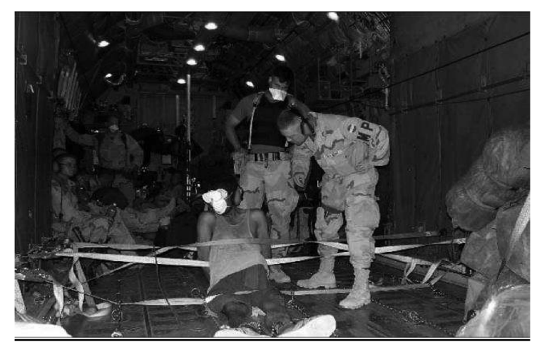
Exhibit I: Photograph of Camp X-Ray

Appendix H: Photograph of Transport to Guantanamo