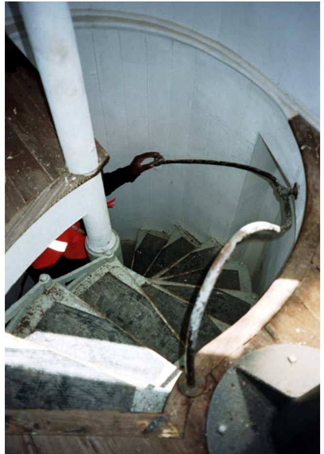
Winding staircase leading to the light