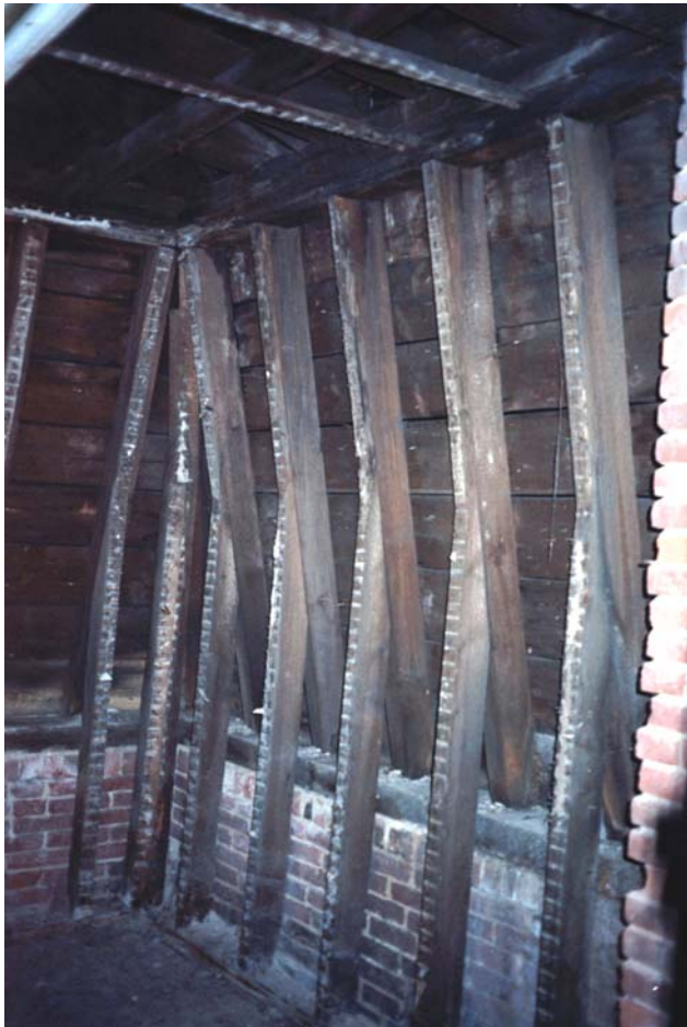
Stud walls in the interior