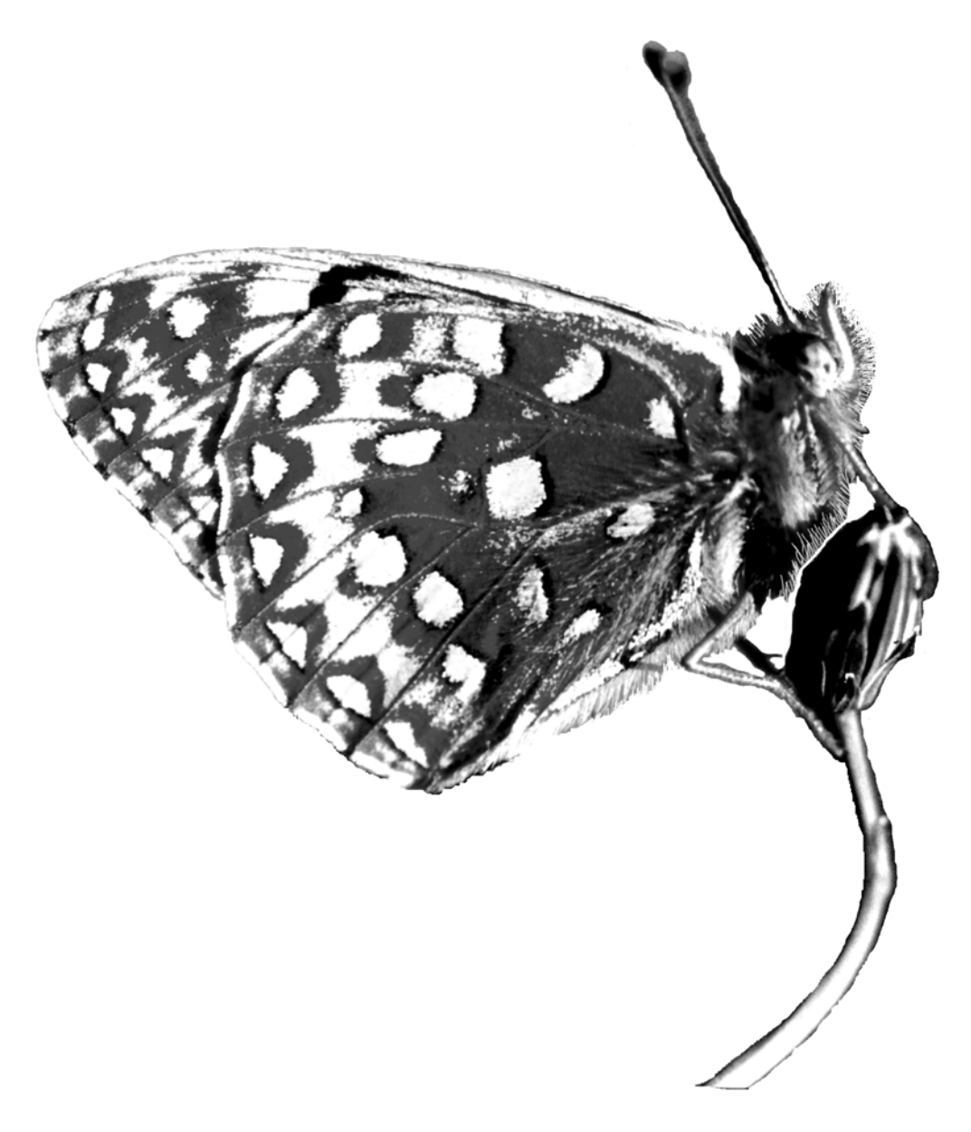
Figure 2. Oregon silverspot butterfly, side view