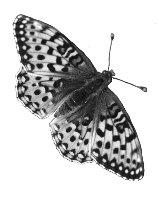
Figure 1. Oregon silverspot butterfly, top view