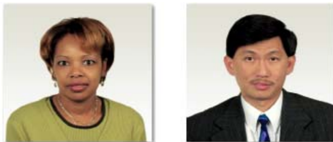
Examples of Well-Composed Visa Photos

For additional information, you may visit: http://travel.state.gov/passport/pptphotos/index.html