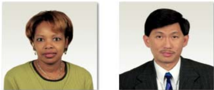
Examples of Well-Composed Visa Photos

For additional information, you may visit: http://travel.state.gov/passport/pptphotos/index.html