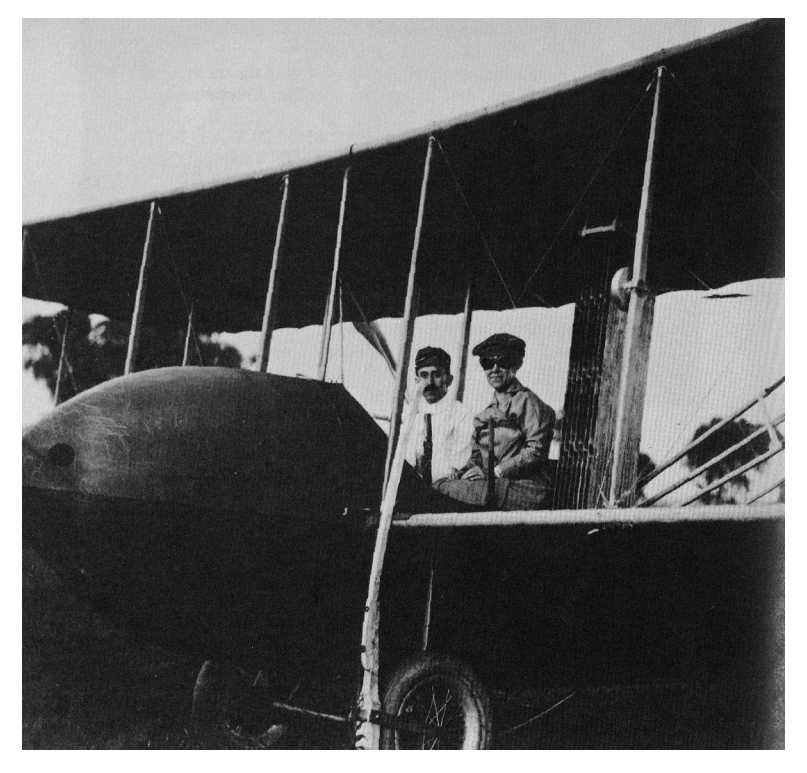
Katharine Wright, wearing a leather jacket, cap, and goggles, aboard the Wright Model HS airplane with Orville, 1915.

Orville and Katharine, wearing leather jacket, cap, and goggles, in Wright airplane model HS, 1915. LC-USZ62-56222; LC-W85-129; MCFWP 221