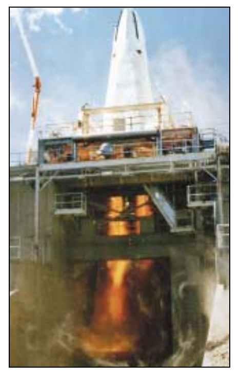
Static firing of DC-X with 4 LOX/Hydrogen RL10-A5 engines.