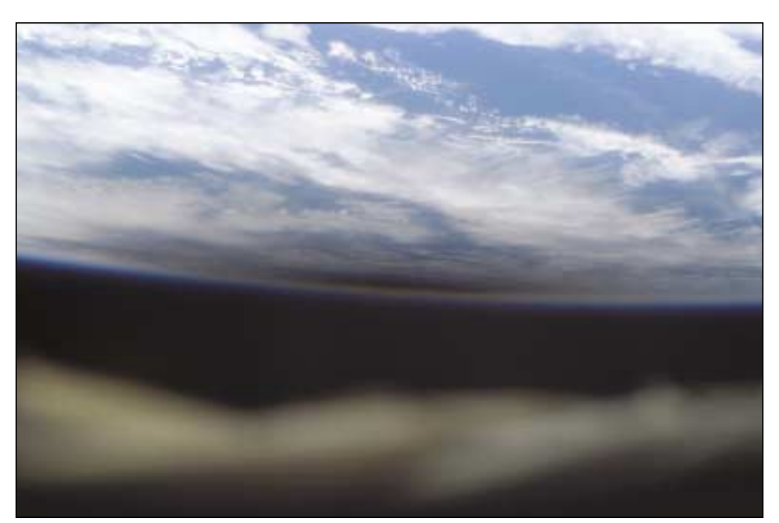
The dark area near Earth's horizon at center frame is actually a shadow cast by the Moon during the total solar eclipse of Dec. 4, 2002. The shadow obscures an area of cloud cover. The station, with three Expedition 6 crewmembers aboard, was over the Indian Ocean at the time of the eclipse. The out-of-focus object in the foreground is part of the frame for the viewing port.

" If you look at the bigger picture, even though we are going to the Moon and Mars, there is always going to be an intense interest by the public on what's happening on the surface of Earth," Lulla said. "NASA will always have to have an active program where we are looking back on Earth and creating awareness of our own planet, our own habitat, our own home."