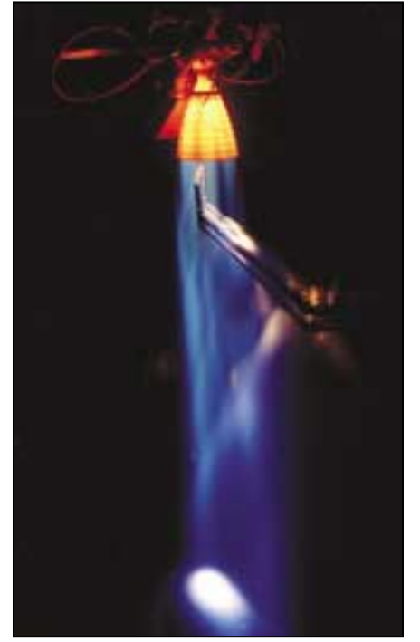
Water-cooled probes measure exhaust characteristics of 100 lbf attitude control thruster.