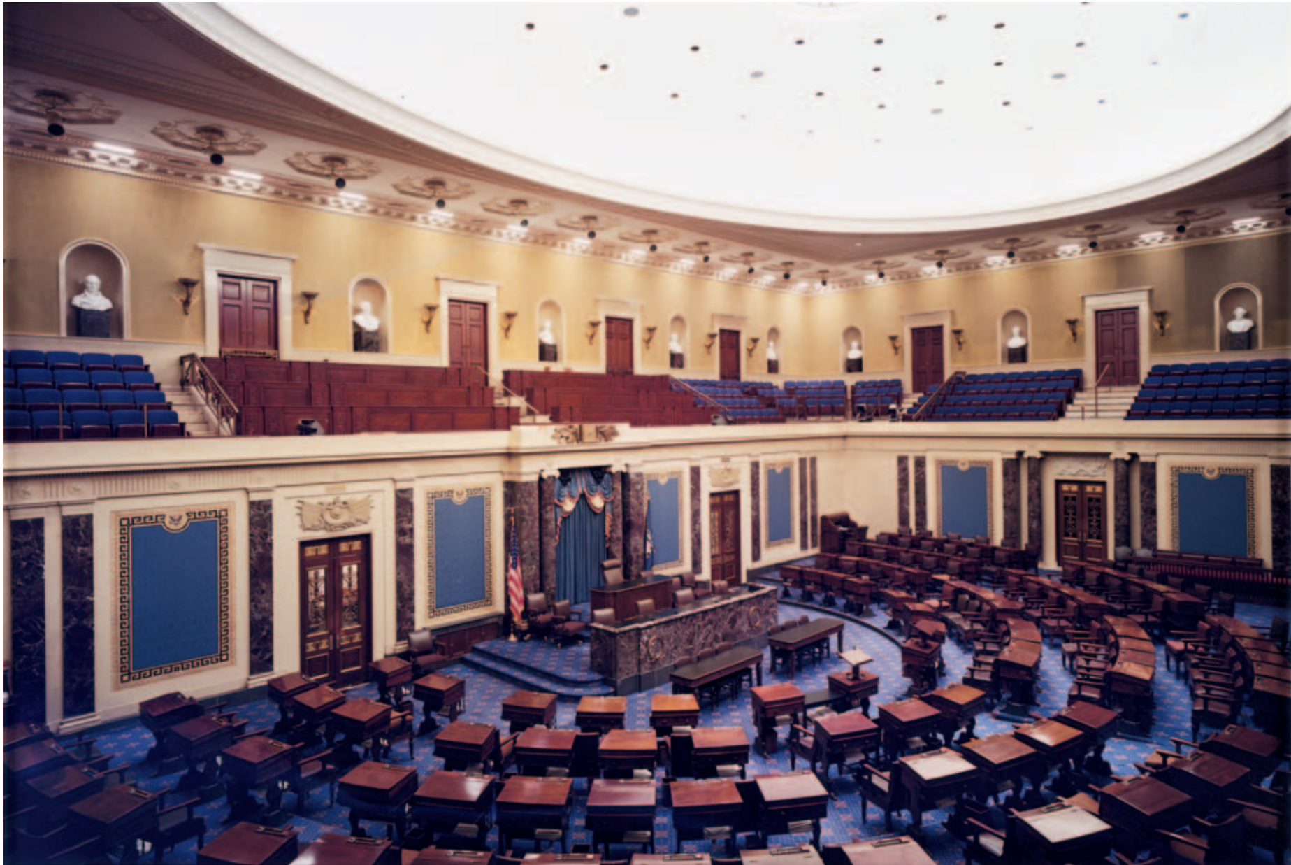
The Senate Chamber at the end of the twentieth century.