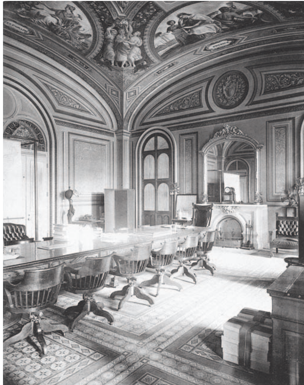
ROOM OF THE SENATE COMMITTEE OF THE DISTRICT OF COLUMBIA.

S-211, now the Lyndon Baines Johnson Room, under the jurisdiction of the Secretary of the Senate.