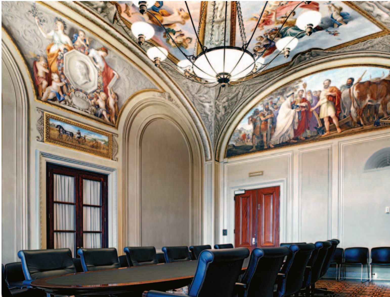
H-144, the House Committee on Appropriations.