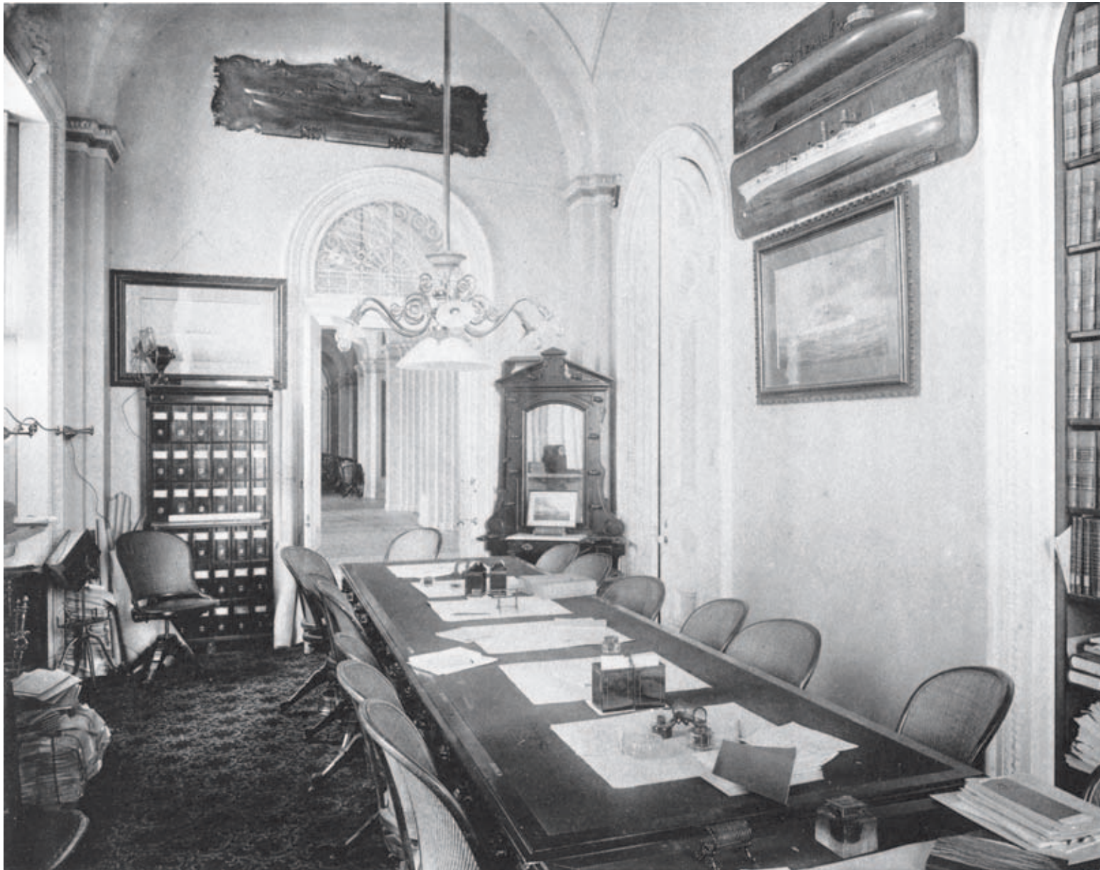
NAVAL COMMITTEE ROOM, HOUSE OF REPRESENTATIVES.

H-219, now used by the House Majority Leader.