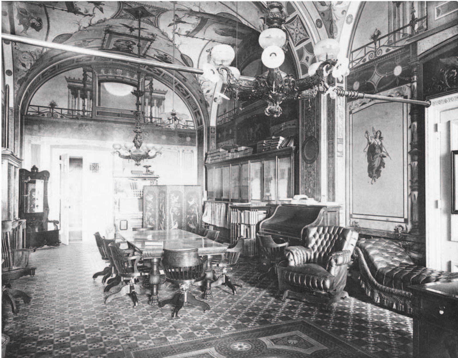
NAVAL AND PHILIPPINE COMMITTEES ROOM, SENATE WING.

S-127, now used by the Senate Committee on Appropriations.