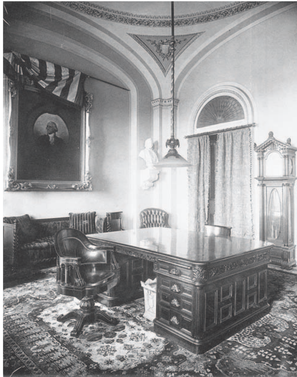
THE VICE PRESIDENT'S ROOM, NORTH WING.

S-214, now the formal Office of the Vice President. The painting of Washington has been moved to the restored Old Senate Chamber.