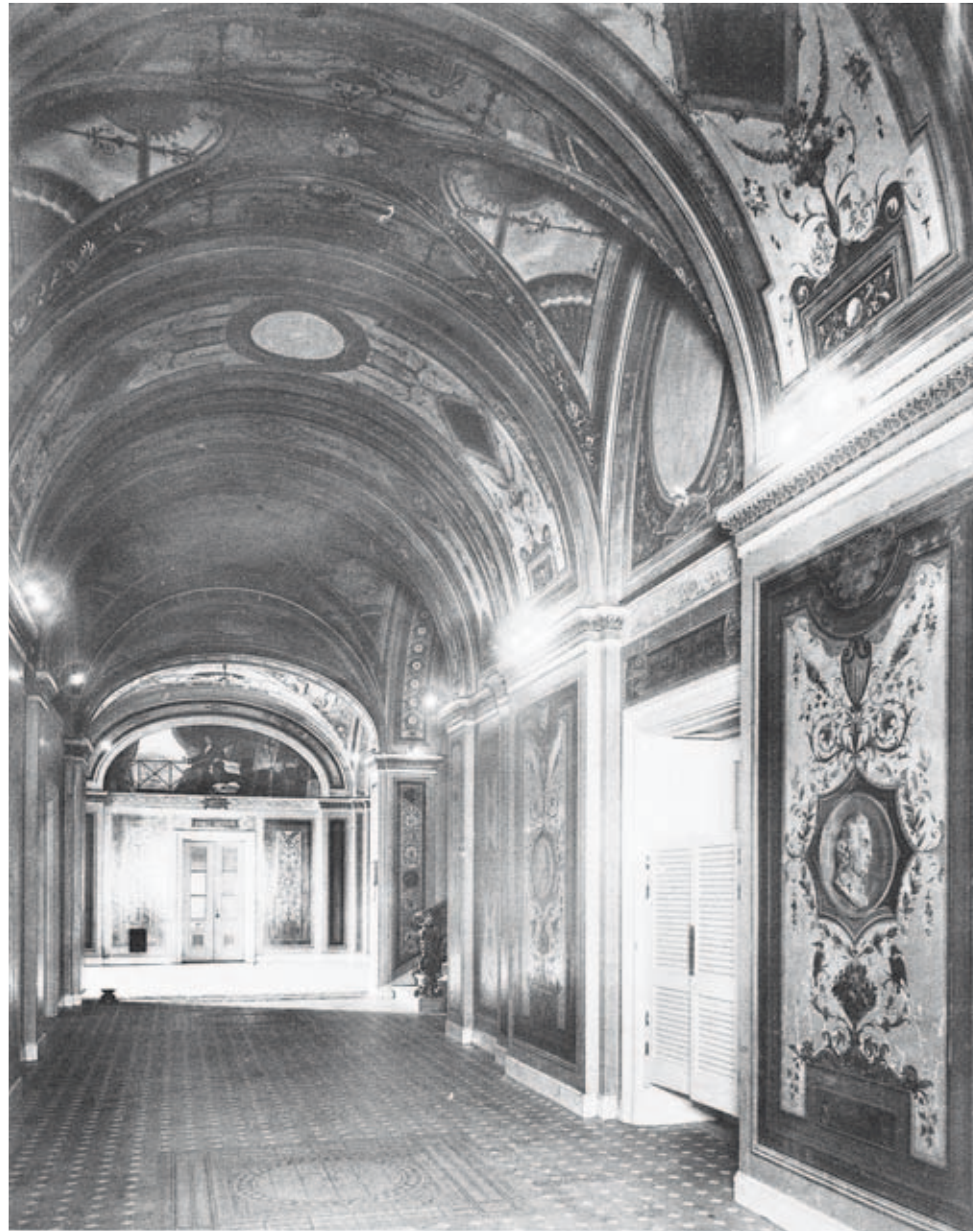
CORRIDOR BASEMENT, NORTH WING, FRESCOES BY BRUMIDI, PAINTER. The North Corridor, one of the Brumidi Corridors, looking east toward S-116.