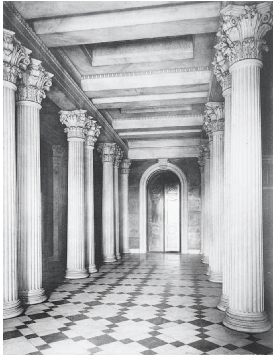
SENATE CORRIDOR, PRINCIPAL STORY.

View to the west, Senate Chamber doors. The space behind the screen of columns has been infilled with elevators (related drawing, plate 208).