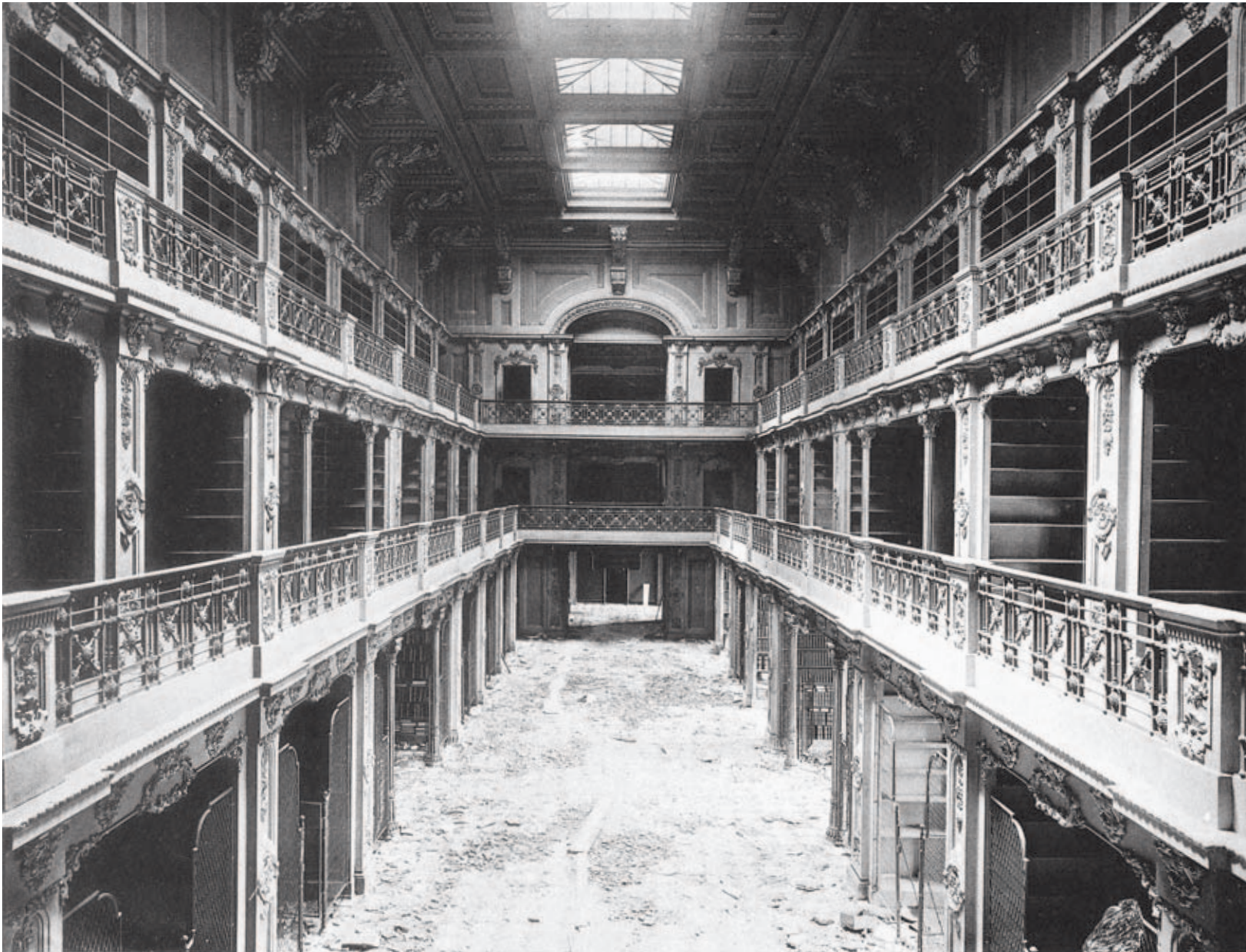
OLD CONGRESSIONAL LIBRARY.

Photograph taken during the Library's demolition in 1900.