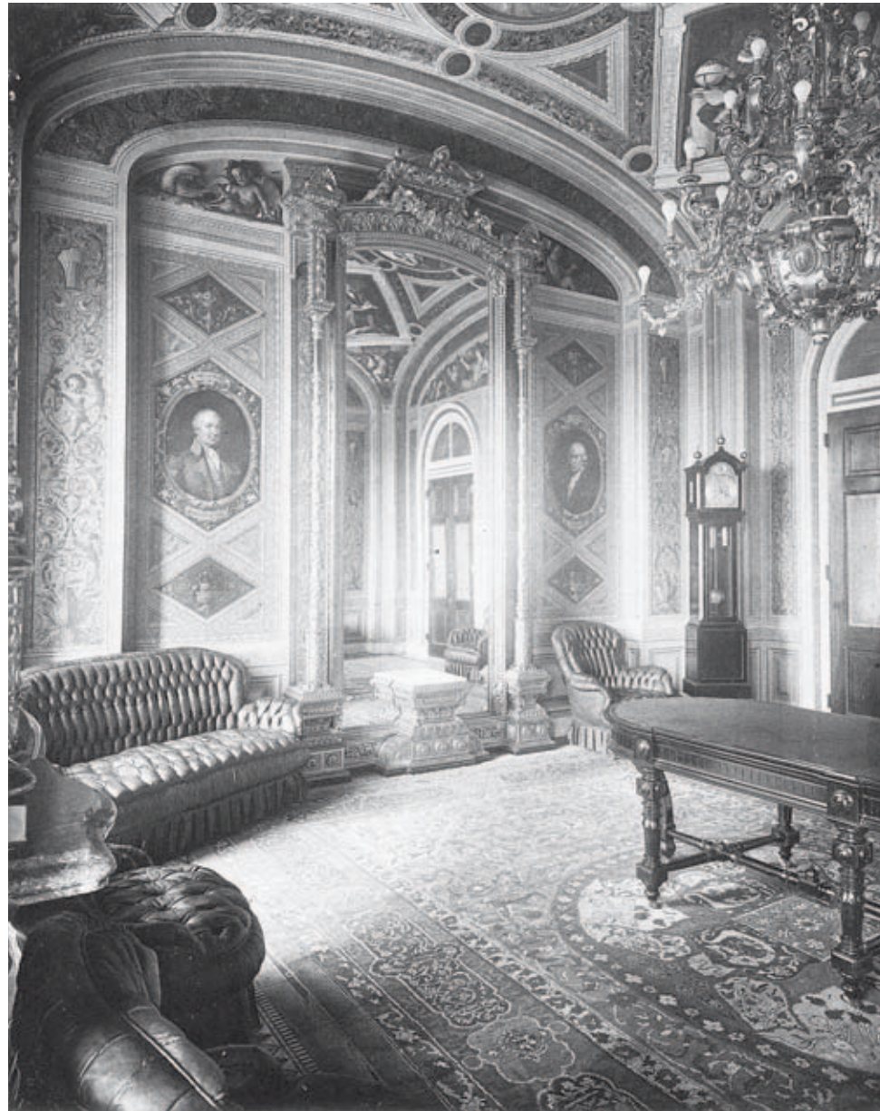
THE PRESIDENT'S ROOM, NORTH WING.

S-216. The room's appearance is largely unaltered; the original chandelier and furniture have been retained.