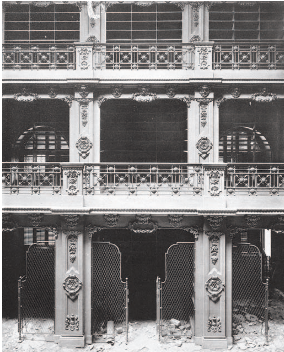
DETAIL OF IRON WORK IN OLD CONGRESSIONAL LIBRARY,—T. U. WALTER, ARCHITECT. Photograph taken to record this work before demolition in 1900.