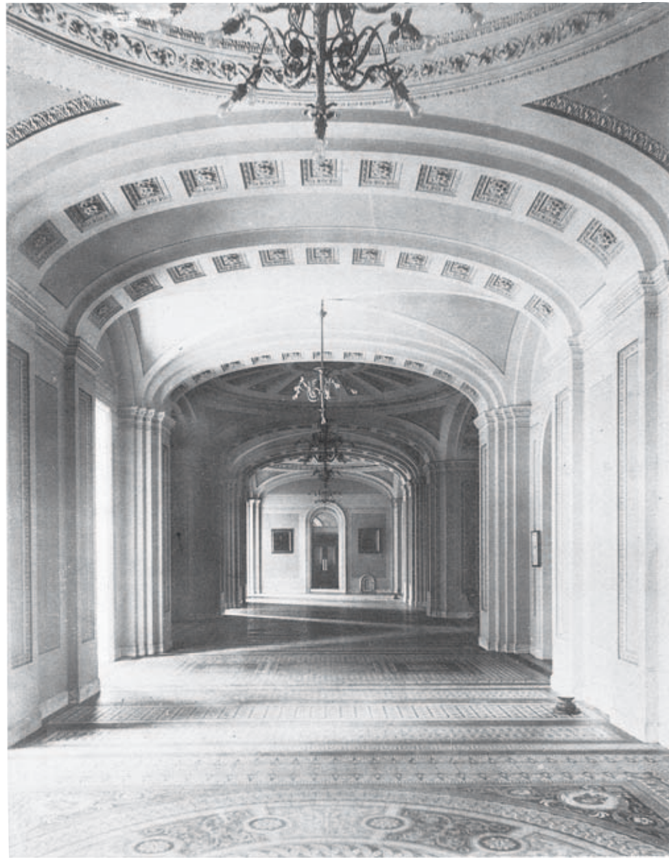
SENATE CORRIDOR, PRINCIPAL FLOOR.