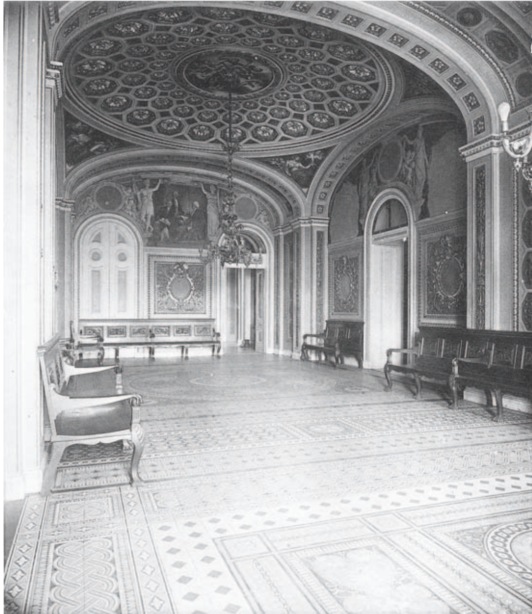
PUBLIC RECEPTION ROOM, PRINCIPAL STORY, NORTH WING