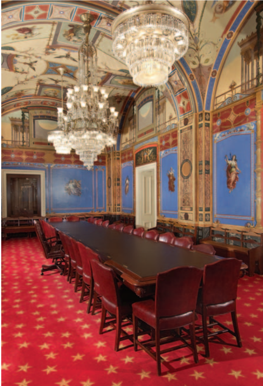
S-127, Senate Committee on Appropriations.