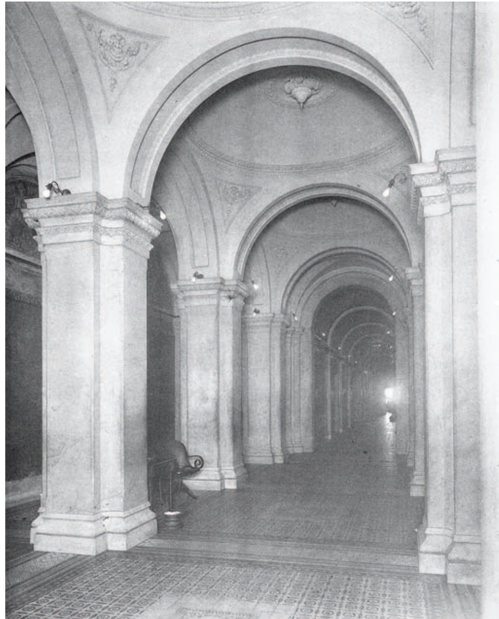
CORRIDOR, BASEMENT NORTH WING.

Today this space is the east elevator lobby (related drawing, plate 216).