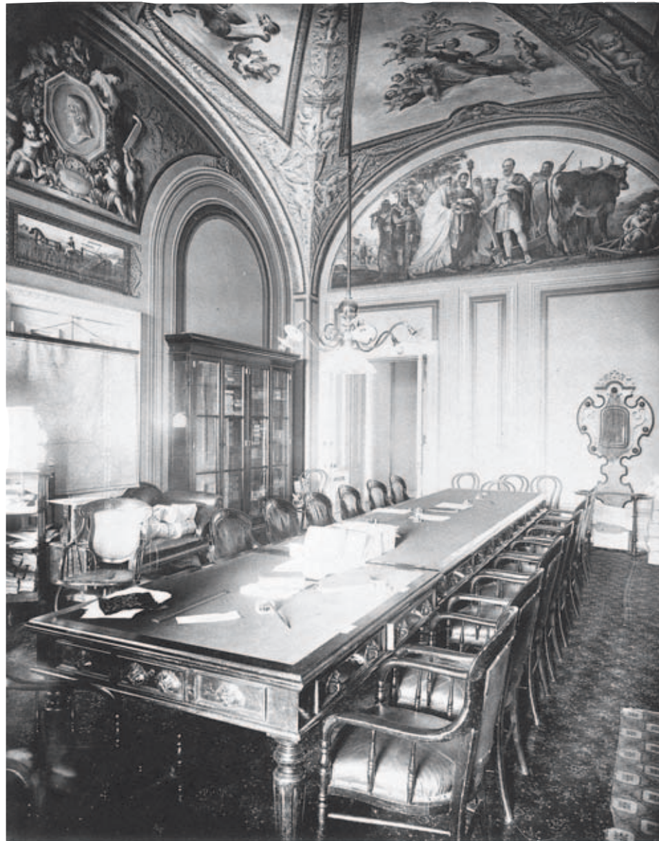
COMMITTEE ON AGRICULTURE, HOUSE OF REPRESENTATIVES.

H-144, now used by the House Committee on Appropriations. This was the first room frescoed by Constantino Brumidi.