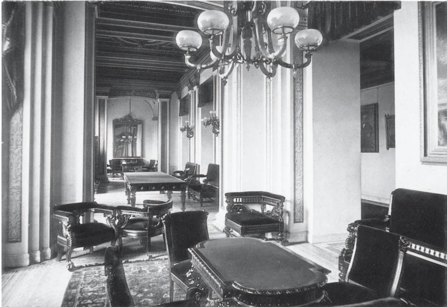
LOBBY OR CORRIDOR, SOUTH OF HOUSE OF REPRESENTATIVES.

H-212, 213, and 214, Member's Retiring Room. The center space was the original Speaker's office.