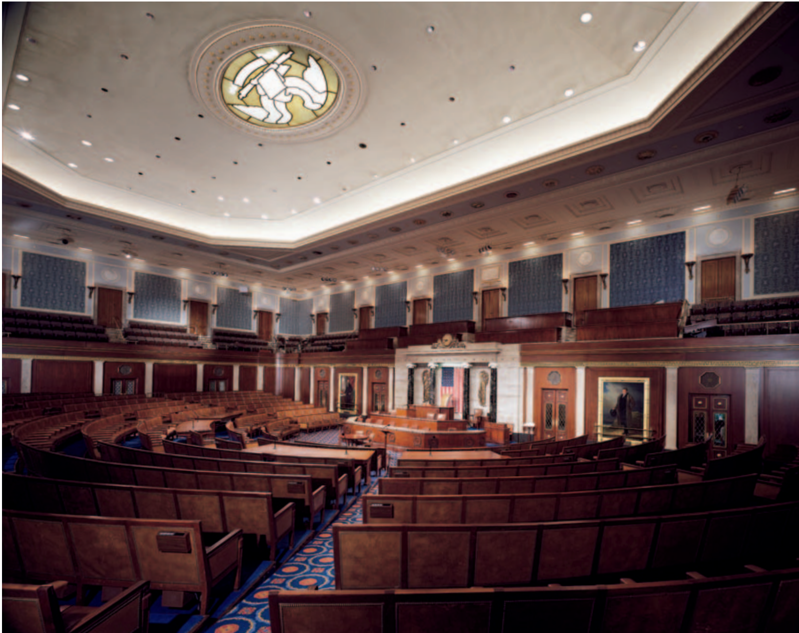
The House of Representatives Chamber at the end of the twentieth century.