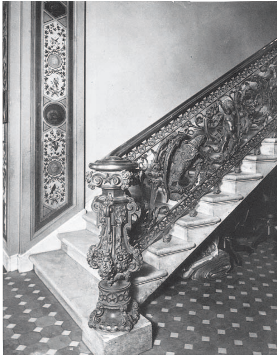
SENATORS PRIVATE BRONZE STAIRWAY, NORTH WING,—T. U. WALTER ARCHITECT. Designed by Constantino Brumidi, modeled by Edmond Baudin, and cast by Archer, Warner, Miskey and Co. of Philadelphia, 1857–59 (related drawing, plate 213).