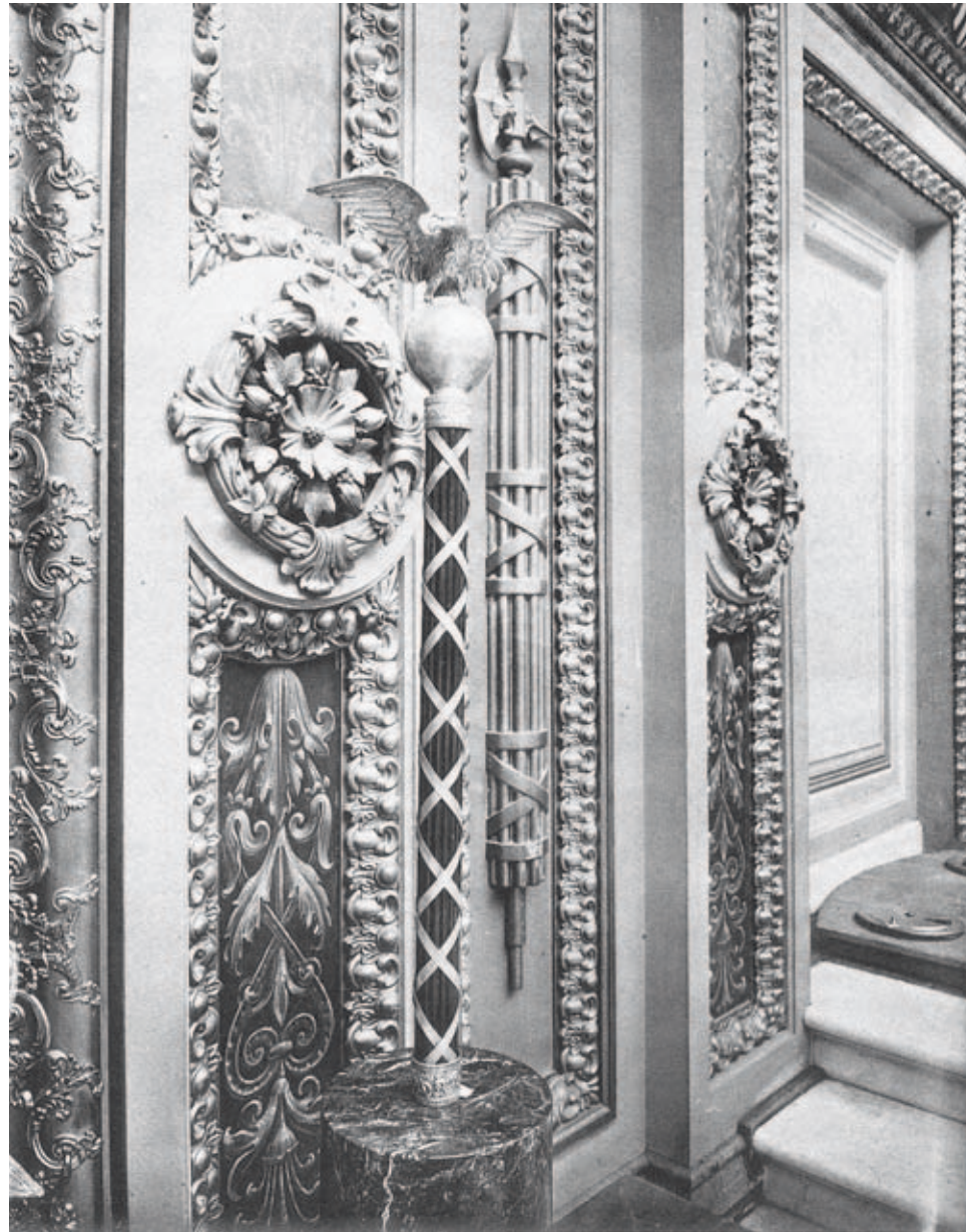
MACE OF SARGENT-AT-ARMS. UNITED STATES HOUSE OF REPRESENTATIVES.

This mace is still used today in the modern chamber.