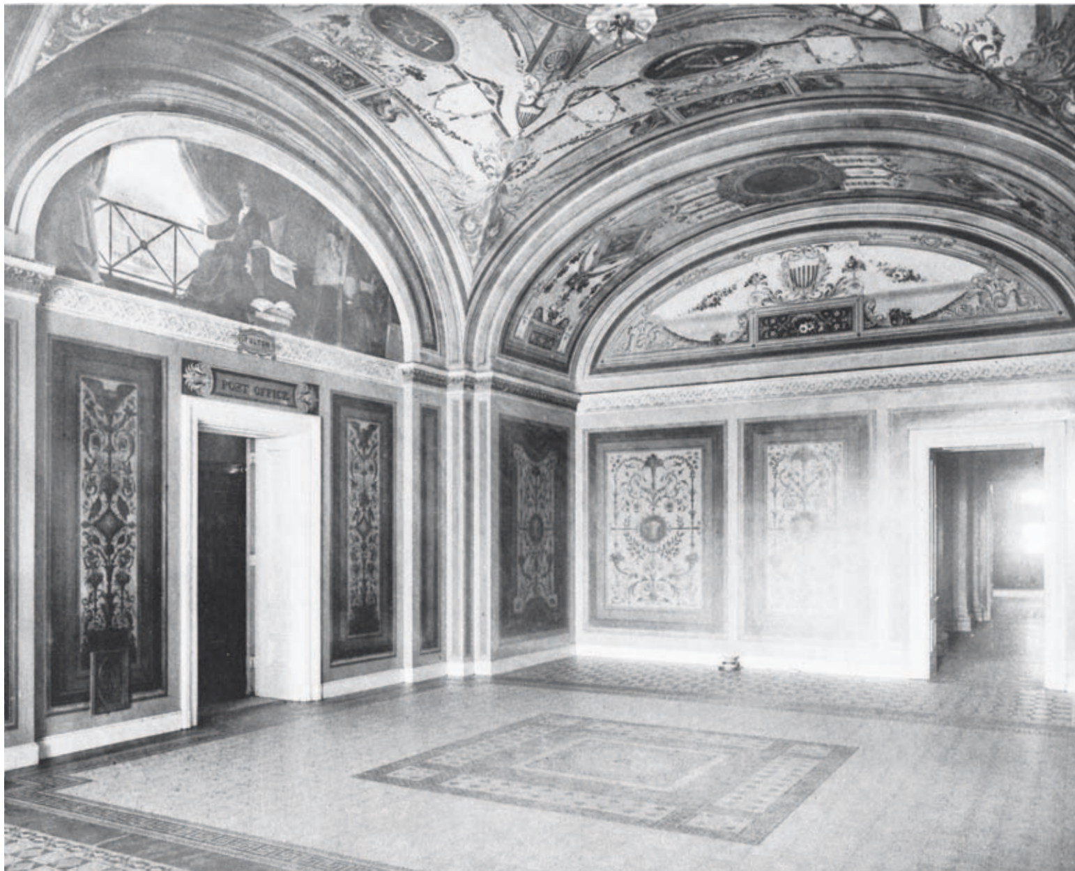
PUBLIC ROOM, NORTH WING, BASEMENT.

The Patent Corridor, one of the Brumidi Corridors, outside the entrance to S-116.