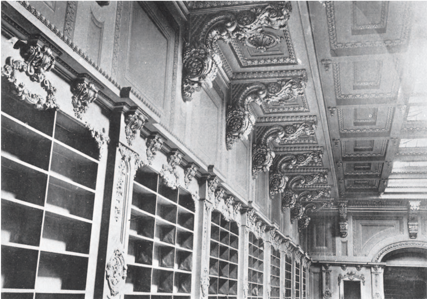
CEILING OF WEST HALL, OLD CONGRESSIONAL LIBRARY,—T. U. WALTER, ARCHITECT.

This photograph was taken to record the design of the ceiling and consoles, but it also shows the empty bookshelves in the abandoned library just before demolition in 1900 (related drawing, plate 210).