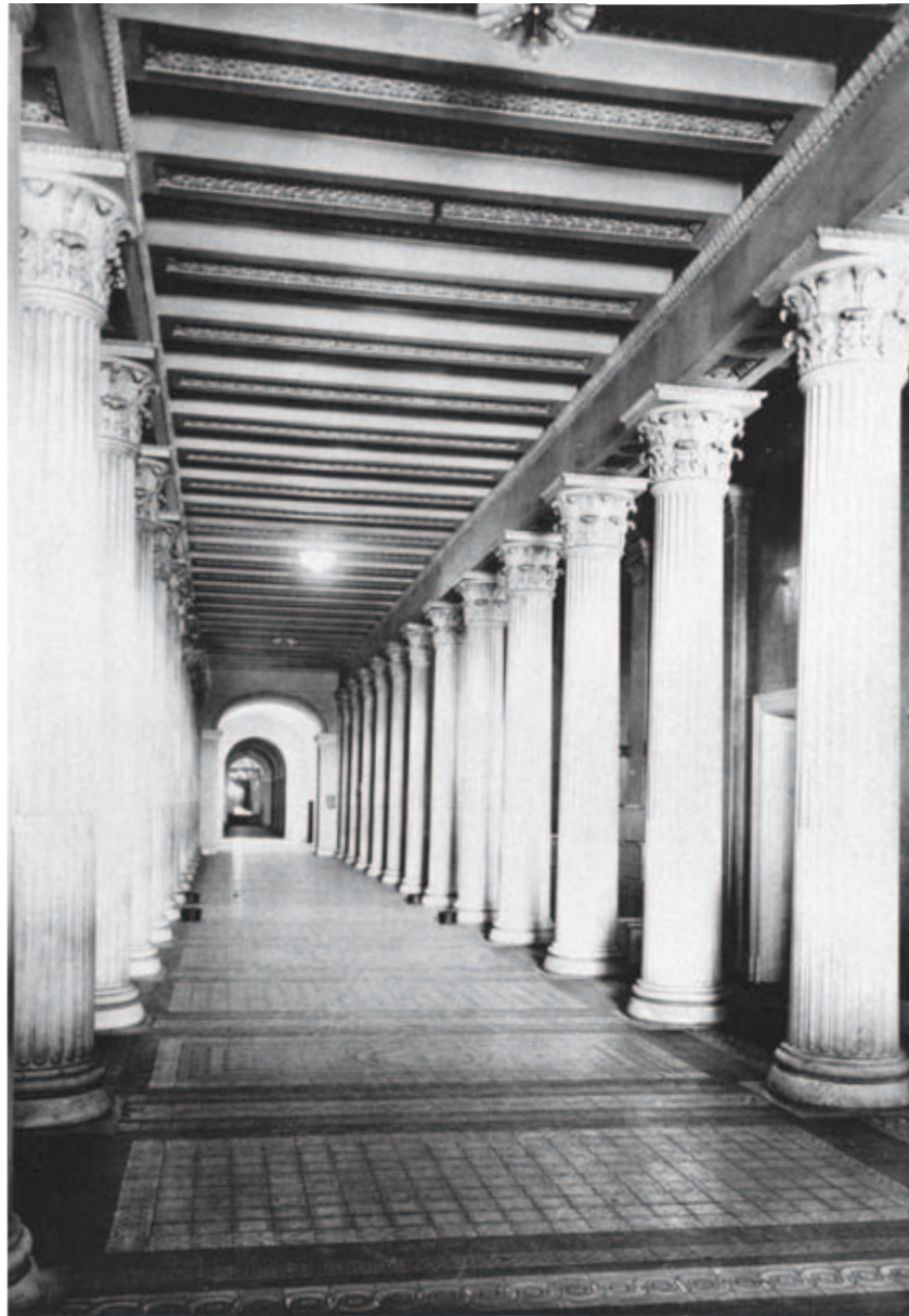
BASEMENT HALL, SOUTH WING.

The Hall of Columns (related drawings, plates 205 and 207). The Mindon tiles have been replaced with marble.