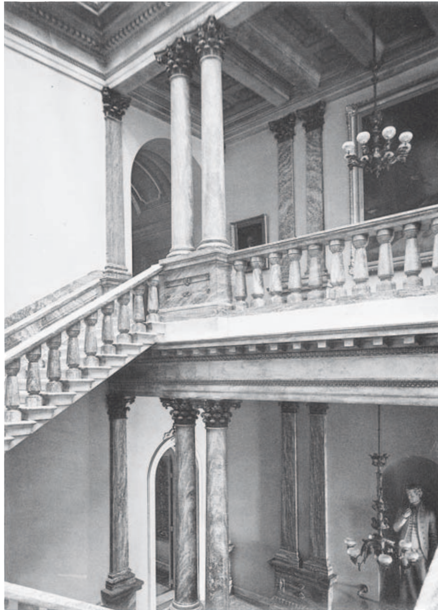
FOUR PRINCIPAL STAIRWAYS, SIMILAR IN DESIGN ON HOUSE AND SENATE WING. This marble staircase is located on the east side of the House wing between the second and third floors.