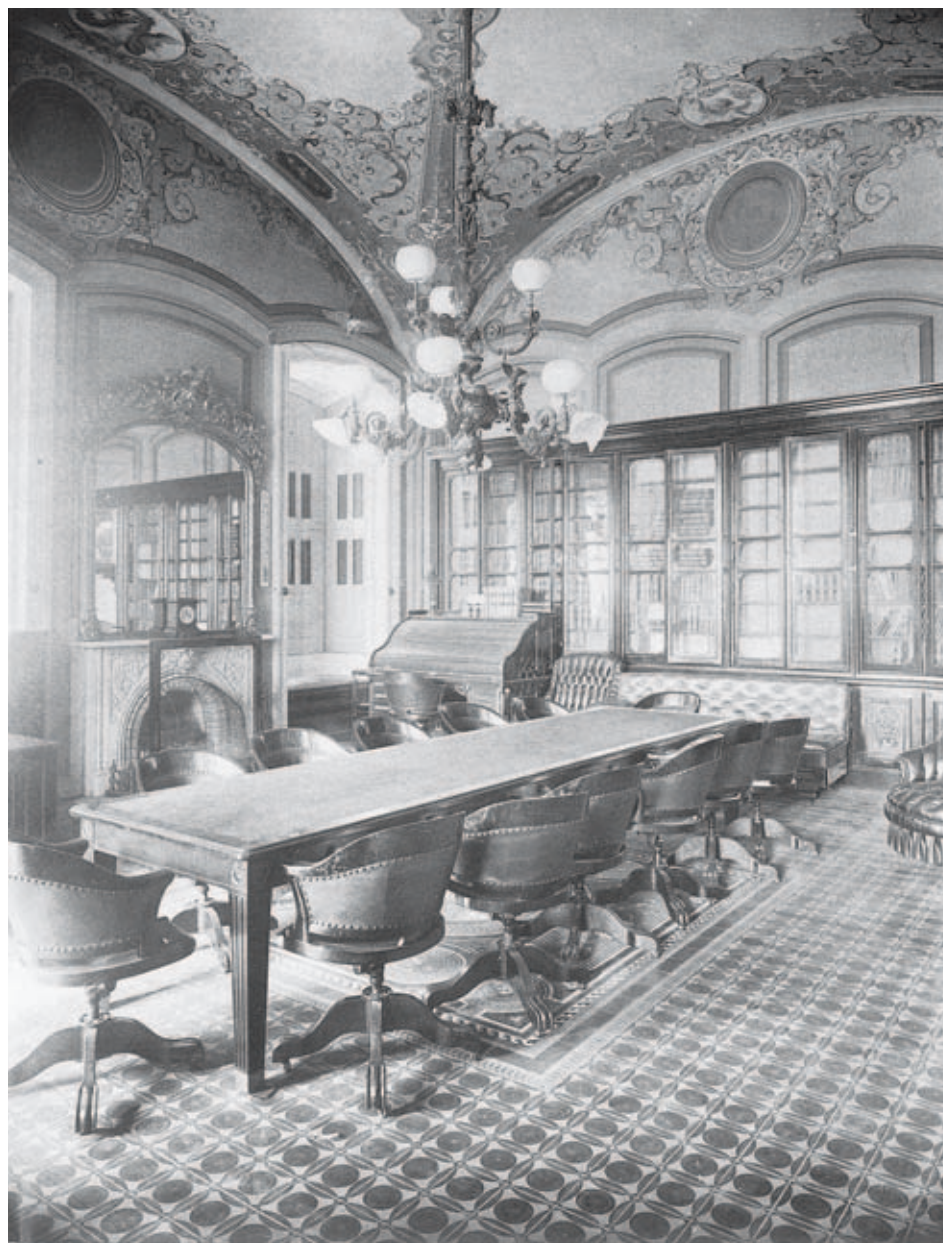
JUDICIARY COMMITTEE ROOM, SENATE.

S-126, now part of the suite occupied by the Senate Committee on Appropriations. The ceiling murals were later covered with other designs.