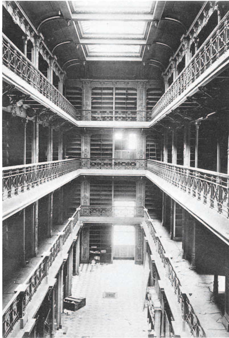
NORTH AND SOUTH HALLS, OLD CONGRESSIONAL LIBRARY,—T. U. WALTER, ARCHITECT.

These sections of the library space, photographed during the Library's demolition in 1900, were originally built under the direction of Edward Clark in 1865–66.