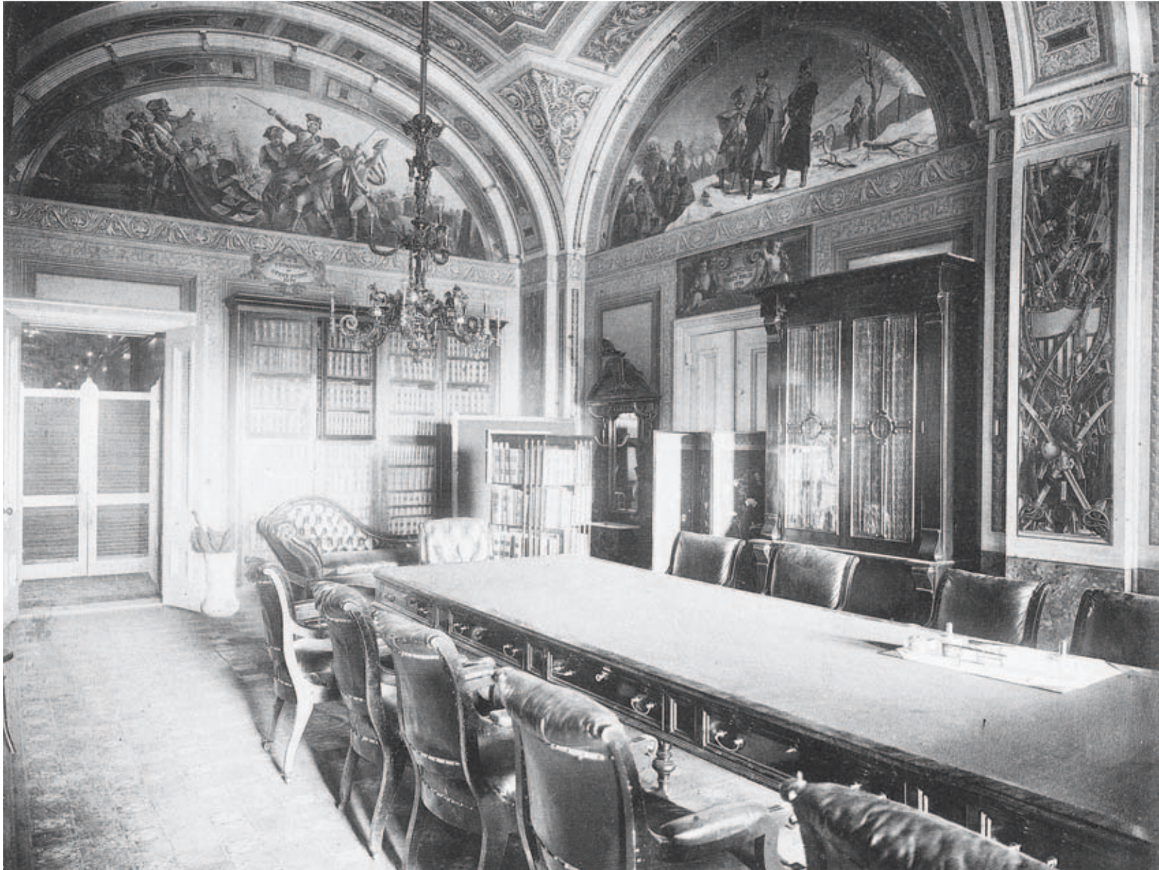
ROOM OF THE SENATE MILITARY COMMITTEE.

S-128, part of the suite now occupied by the Senate Committee on Appropriations.