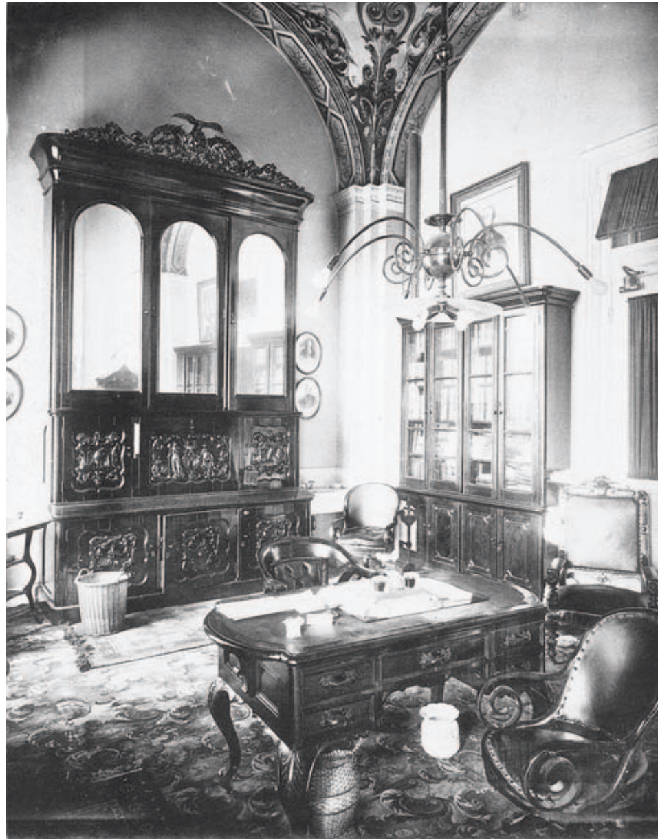
ROOM OF SPEAKER OF THE HOUSE OF REPRESENTATIVES. H-211, now the Parliamentarian's office.