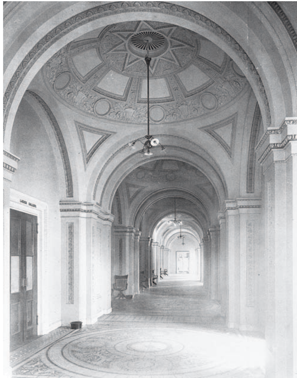
NORTH CORRIDOR, HOUSE OF REPRESENTATIVES.

View west toward H-323 on the third floor.