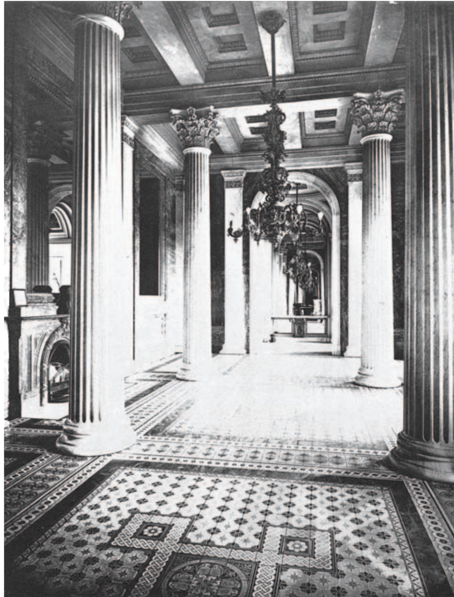
SENATE LOBBY OR RECEPTION ROOM. S-215, the Senators' Retiring Room, also called the Marble Room.