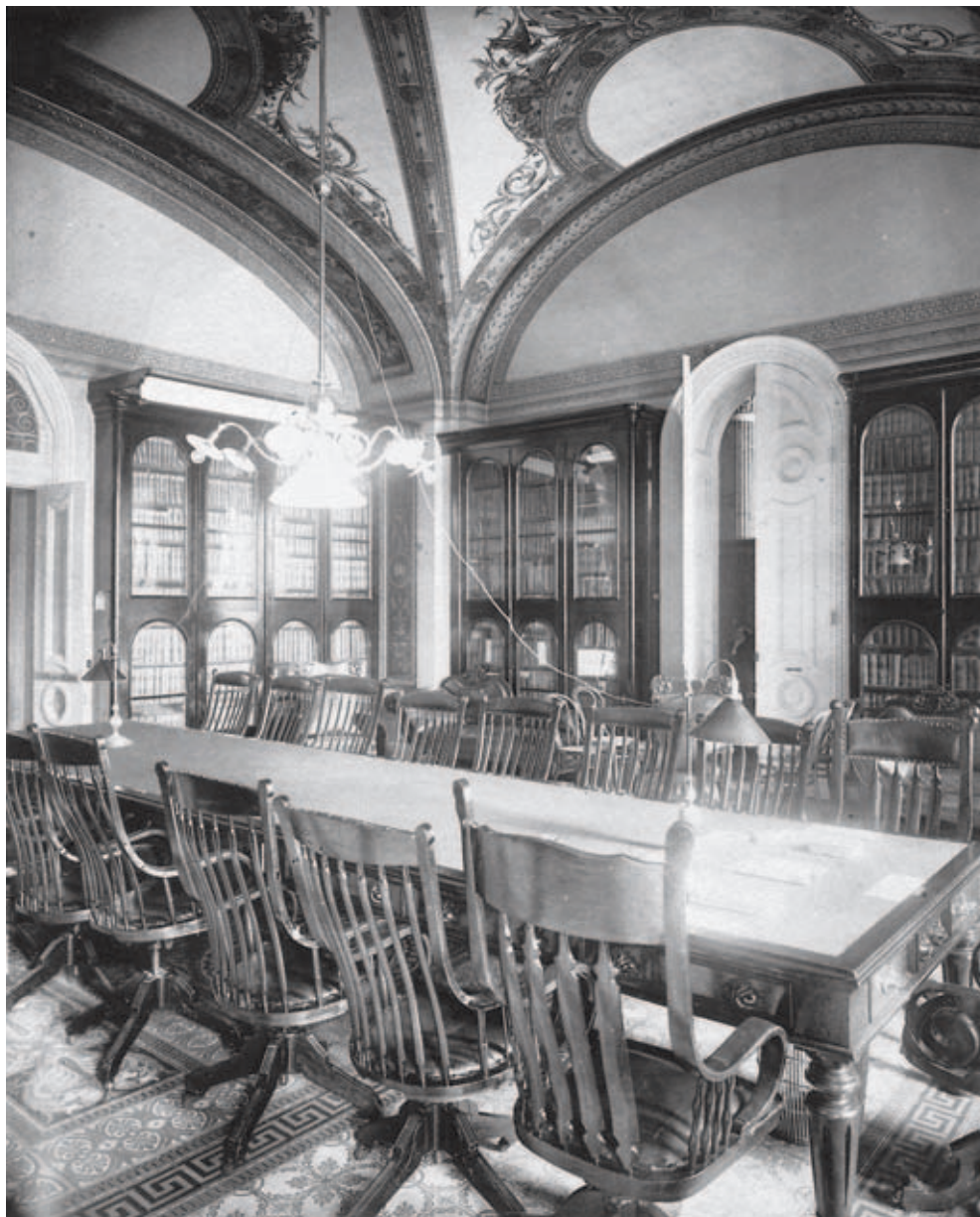
WAYS AND MEANS COMMITTEE ROOM, HOUSE OF REPRESENTATIVES.

H-209, now shared by the Speaker's office and the House Parliamentarian.