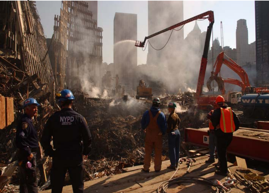
Recovery Workers at the WTC Site in Lower Manhattan