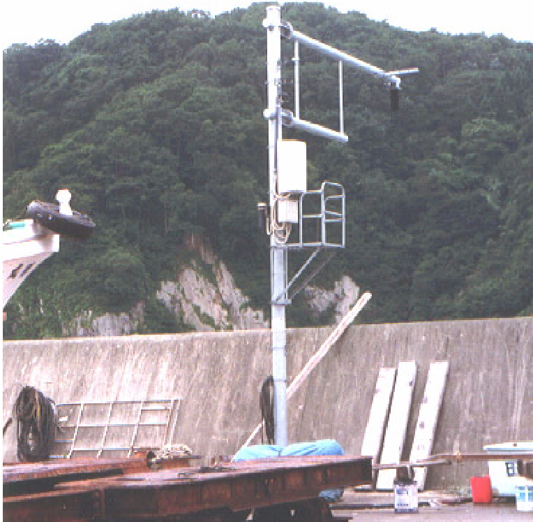
Figure 1: An example of a tsunami gauge established in the Sanriku region (Sato et al. , 1992).

gauges or the gauges placed in the bay mouth. For example, Sato et al. (1992) studied the tsunami amplification factor in Kesennuma Bay of the Sanriku region, using the observed tsunami data at the head and mouth of the bay. They found that it takes 10 to 15 min for tsunamis to propagate from the mouth of Kesennuma Bay into the head of the bay, which is densely populated. Also, Ishida et al. (1998) estimated the tsunami amplification factor in the head of the bay as the function of tsunami wave period observed at the mouth.