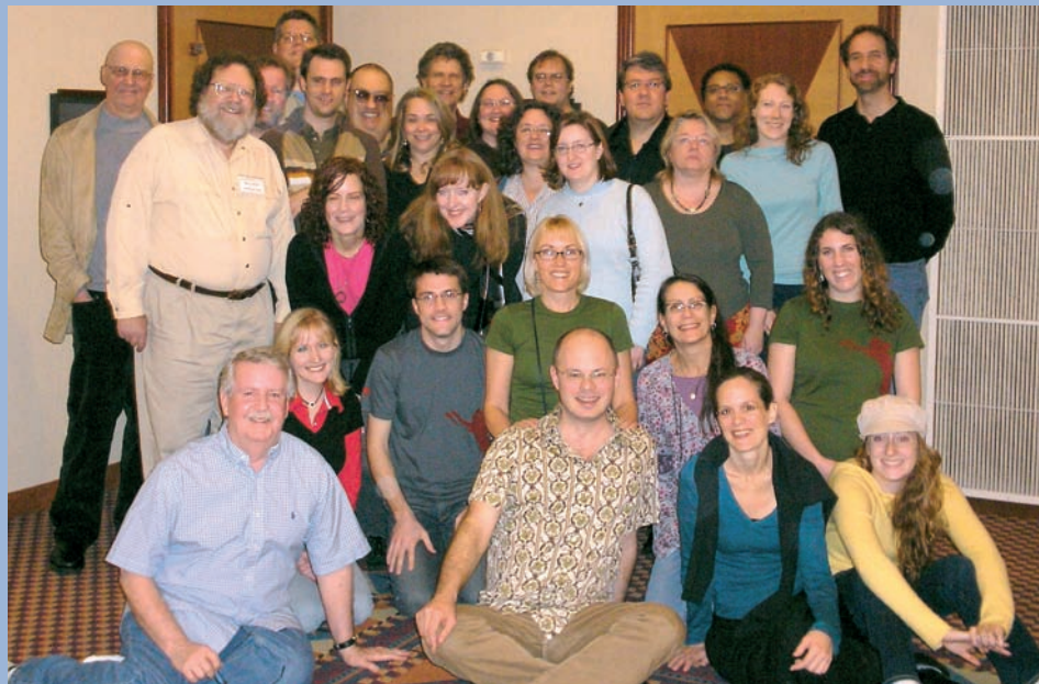
The 2007 class of the NEA Arts Journalism Institute in Theater and Musical Theater at the Annenberg School for Communication at the University of Southern California.