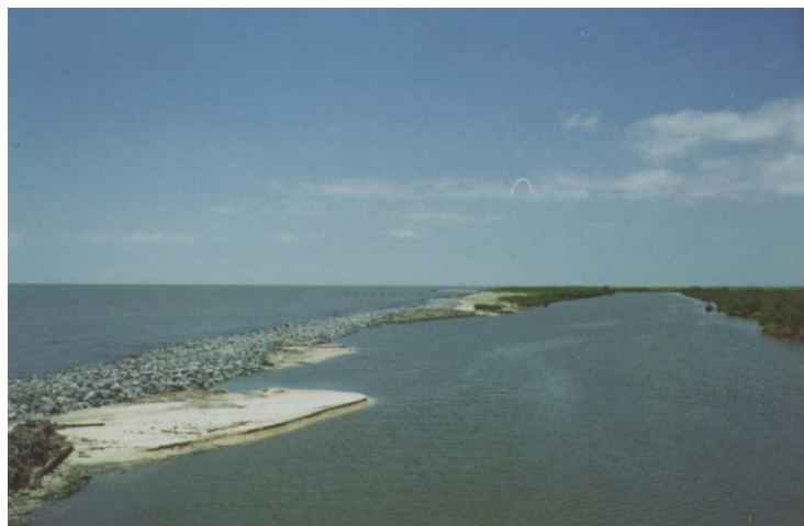
This section of Mobil Canal was backfilled and armored with rock to reestablish the separation between the canal and the gulf so that salt water would be prevented from damaging the intermediate marshes in the interior of the island.

For more project information, please contact: