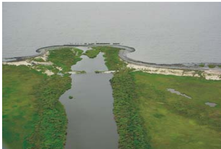
The beach where a pipeline canal meets the Gulf of Mexico has been stabilized with concrete mats thus preventing saltwater intrusion into the interior wetlands of Point au Fer Island.

The shoreline erosion rate along the plugged canals (Phase/Area 1) has not been reduced. Visual observations indicate that the shoreline stabilization project (Phase/Area 2) has halted erosion, but monitoring data is still under analysis. This project is on Priority Project List 2.