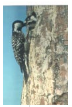
Species of animals and plants that have been driven to the brink of extinction are dependent on research that focuses on ecosystem integrity.