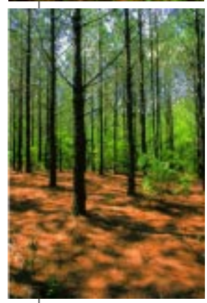
Continued monitoring of vegetation management enables scientists to weigh the benefits of increased crop tree growth with changes in soil productivity, wildlife habitat, and biological diversity.