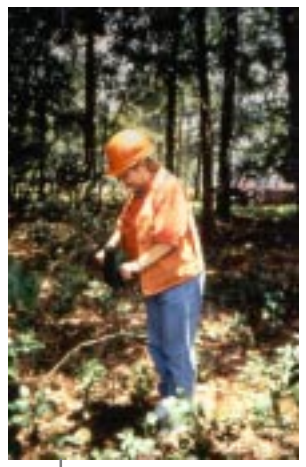
Soil compaction, removal of organic matter, and tree growth are carefully measured in long-term SRS studies.

The regional nature of the LTSP study and the types of environmental monitoring that are conducted have enabled scientists from four SRS research work units to begin a study of coarse woody debris decomposition on the sites. Decomposition rates for various sizes of woody debris will be correlated to environmental conditions on the sites and to the role of termites and other wood-inhabiting insects. Over time, changes in chemical composition (tannins and structural chemicals) also will be determined and related to other measured variables.