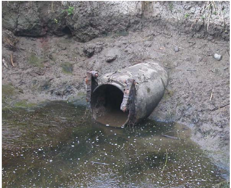
Figure 1. Example of a concrete pipe culvert with failed (missing) tidegate.

The resulting database includes a total of 371 point features each representing a water control structure. Of these, 164 were field inventoried using the GPS techniques described above and photographed by FWS biologists (Figure 1). A total of 12 point features were identified from the RCAA dataset. Data obtained from Oscar Larson and Associates included 11 structures in the McDaniel Slough area of Arcata Bay. The remaining 184 points were imported from the Caltrans dataset. These imported features were lacking some of the FWS attribute data, as well as photographs.