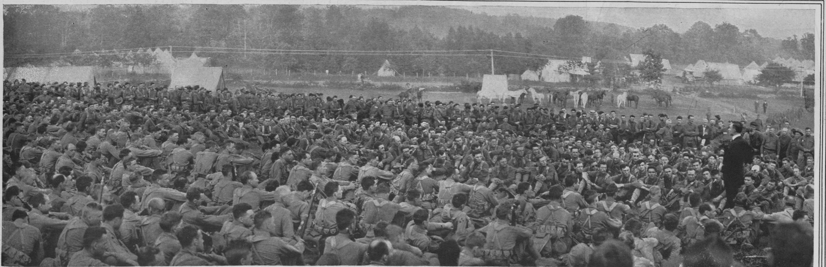
MAYOR JOHN PURROY MITCHEL ADDRESSING THE FOUR MANHATTAN REGIMENTS, COMPRISING THE FIRST BRIGADE, N. G. N. Y., ON THE LAST DAY OF THEIR WAR GAMES ON FISHKILL PLAINS.