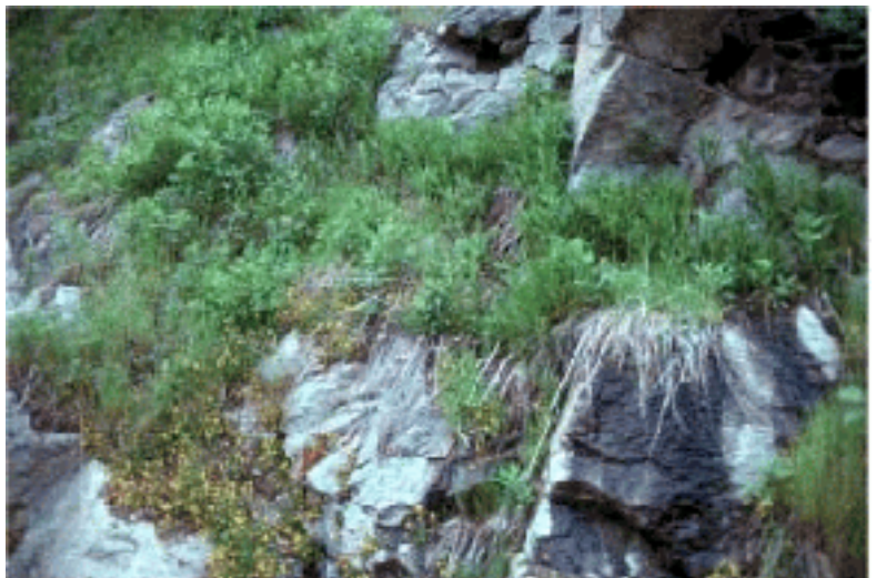
Habitat of Epipactis gigantea