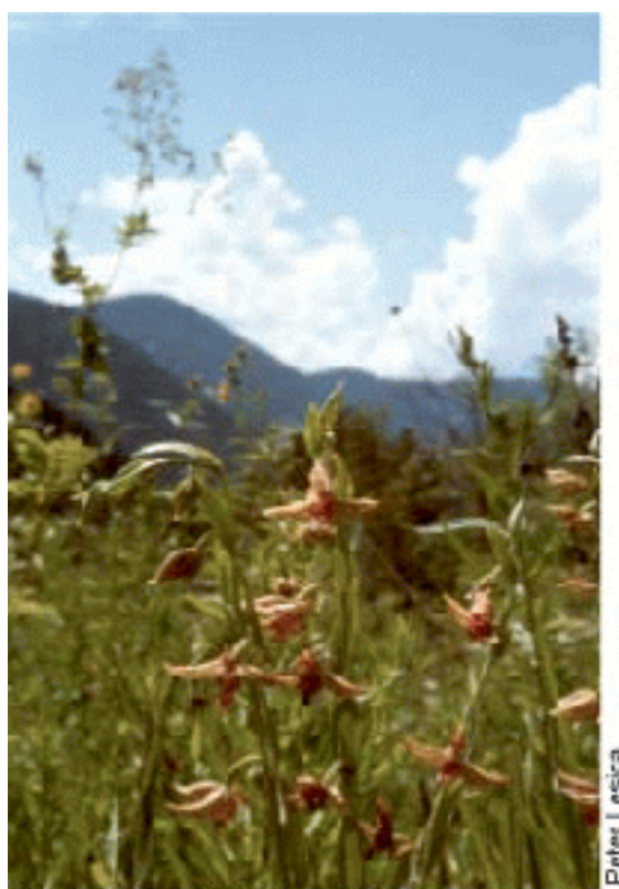
Closeup of Epipactis gigantea