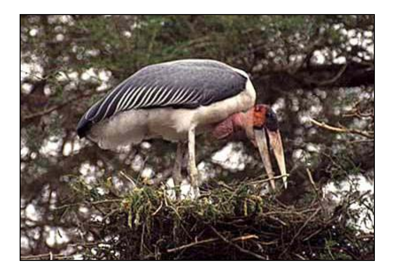
Figure 1 . Marabou stork, Leptoptilos crumeniferus, showing the fluffy undertail coverts that were formerly used in millinery and featherwork.

According to Webster's Third New International Dictionary (Unabridged), marabou is: "1a) a large stork of the genus Leptoptilos ; or 1b) a soft feathery fluffy material prepared from the long coverts of marabous or usually from turkey feathers and used especially for trimmings." The association of the general term "marabou" (fluffy decorative feather material) with the marabou stork ( Leptoptilos crumeniferus ) of Africa is due to the very fine, fluffy undertail coverts of that species (Figure 1). Indeed, the genus name Leptoptilos derives from the Greek words for fine ( leptos ) and feather ( ptilos ). These feathers were popular in Europe for the millinery trade and for decorative featherwork, especially in the 19<sup>th</sup> and early 20<sup>th</sup> centuries.