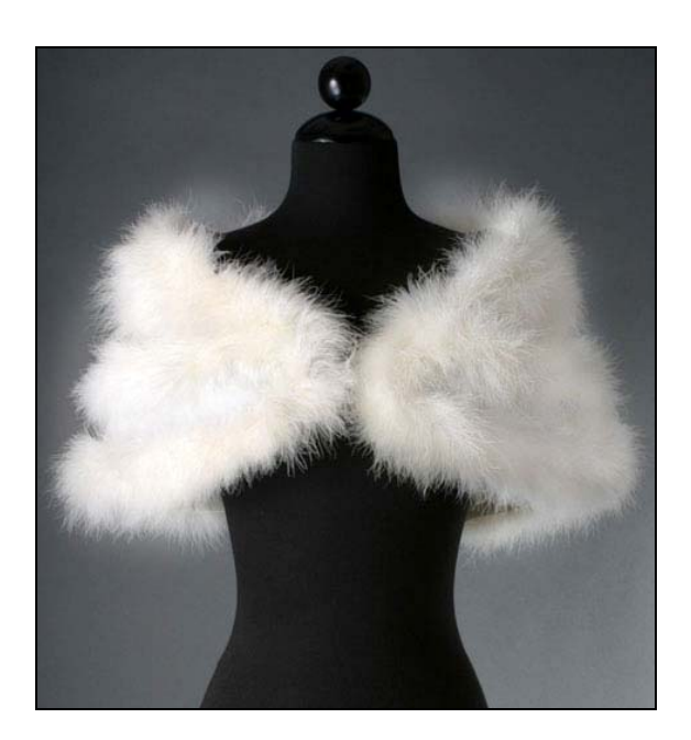
Figure 4 . "Marabou" wrap constructed of turkey feathers.

It is likely that all the feathers, garments, and skin pieces listed in the CITES Trade Database as Leptoptilos crumeniferus were in fact turkey feathers described as "marabou" in the sense of the second definition above, namely "soft feathery fluffy material." In analyses of wildlife products at the National Fish and Wildlife Forensics Laboratory, actual marabou stork feathers have never been encountered. However, turkey "marabou" feathers are often seen, in uses ranging from garments to feather boas to trim on masks to fishing flies (Figures 4 and 5).