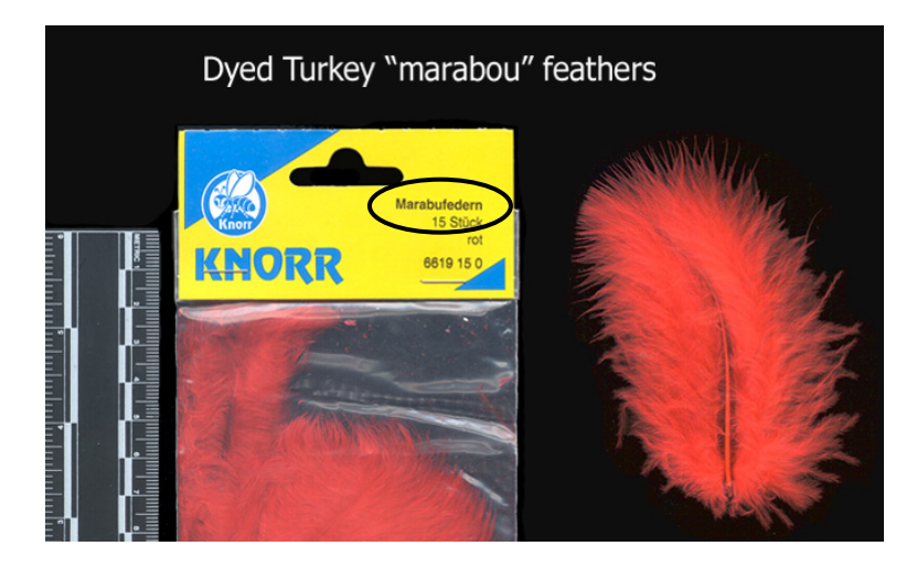
Figure 3. Package of dyed turkey "marabou" for decorative use. Note the obvious "window" along the shaft of the feather.

The CITES Trade Database (http://www.unep-wcmc.org) lists 5807 Leptoptilos crumeniferus items in export trade between 1984-2004. The breakdown of this trade by item type in the CITES database is as follows: bodies = 4; bones = 1; eggs = 6; feathers = 3298; garments = 51; live = 1588; skin pieces = 830; skins = 6; skulls = 1; specimens = 14; trophies = 8. Thus, 98% of trade listed for this species occurs in three categories: live birds (27% of total trade), feathers (57% of total trade), and skin pieces (14% of total trade).