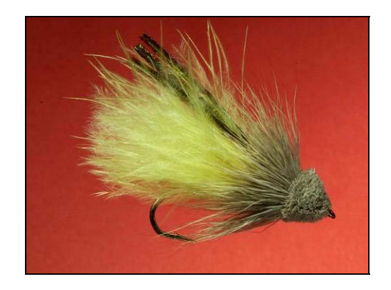
Figure 5 . Fishing fly labeled as a "Yellow Marabou," with dyed turkey barbs.

The use of the word "marabou" on such items probably led to the species name for marabou stork being entered on CITES paperwork, and thus to a misleading picture of the trade in this species. If all feathers, garments, and skin pieces classified in CITES paperwork as Leptoptilos crumeniferus are actually from turkey or chicken, as suspected, this would mean that at least 72% of presumed trade in this species is incorrectly identified (4179 of 5807 export items from 1984-2004).