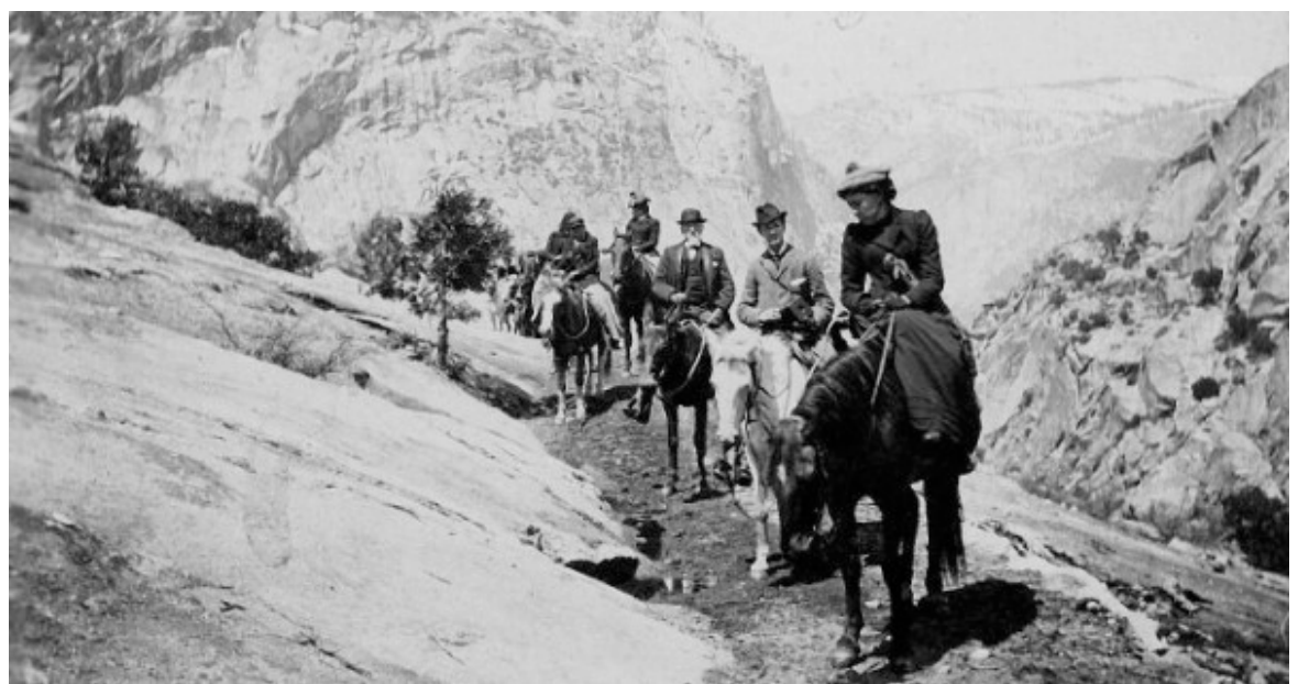
On the trail to Nevada Fall

Visitors arriving by horse-drawn or auto stage used this office to make railroad and lodging reservations, place phone calls, or send telegrams. By 1914 automobiles were common in Yosemite, and the horse–drawn stages were discontinued. By 1915 annual visitation had doubled to 31,000 so stage operations were renewed. In 1916 stages were discontinued for good in Yosemite.