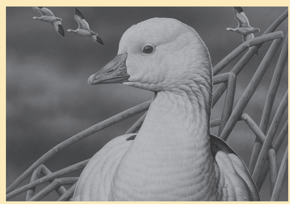
2005 Federal Duck Stamp Contest Winner

All entries must be postmarked no later than midnight August 15, 2006.