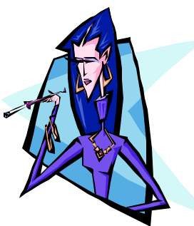
"State your name for the record"

dark with the kind of assets to make any trustee lose his estate where he stood. She walked toward me, slowly, and took the chair in front of my desk. Then she crossed her legs and I felt my automatic stays snap. I fumbled for the tape recorder.