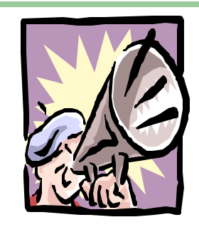
PLEASE USE THE OUTSIDE DE-POSIT BOX FOR ANY FILINGS WHEN THE CLERK'S OFFICE IS CLOSED.

The Clerk's Office will be closed on Monday, February 21, 2000 in observance of President's Day.