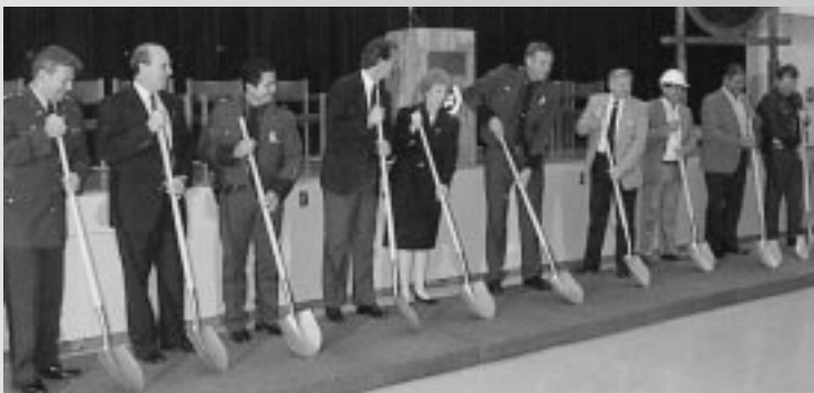
Deputy Commissioner Wyrsh joins Chief Patrol Agent Paul Berg and local and state dignitaries at the groundbreaking ceremony for the new Del Rio sector headquarters.