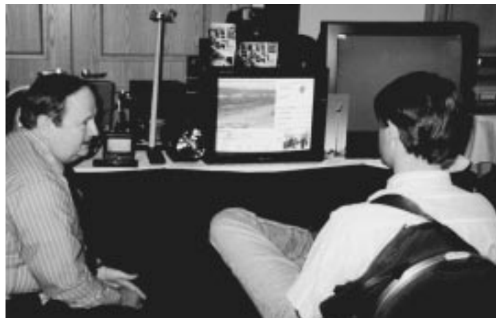
Demonstrating one of the tools INS uses for border management, a technician (left) introduces a conference participant to the Service’s Remote Video Surveillance system. While the system was running live during the conference, a number of illegal aliens were seen attempting to cross the Rio Grande near Laredo, TX.

CIPRIS (Coordinated Interagency Partnership for Regulating International Students) is a reengineered process for students with visa forms I-20/IAP-66. The prototype system demonstrated at the conference was developed in cooperation with the U.S. Information Agency (USIA), U.S. Department of Education, and U.S. Department of State’s Office of Programs and Schools. The system is currently undergoing design and development improvements to meet national requirements.