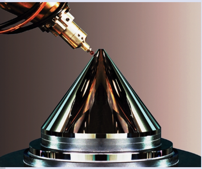
An example of the aspherical mirrors that the Large Optics Diamond Turning Machine first produced.

Previously, Livermore used LODTM to produce three secondary mirrors for the Keck telescopes on Mauna Kea on the Big Island of Hawaii. The Keck telescopes, the largest and most powerful in the world, gather infrared light rather than visible light. For infrared astronomy, diamond turning was the