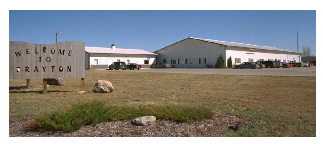
Relocated to safety: The Altru Clinic (left) and a local business, Originals Casual Wear (right), have moved to larger, safer quarters on the edge of Drayton where they can be better protected in the event of another flood. The entire site was raised 1 foot before the buildings were even built.

But there was a catch. The grant needed a 25 percent local match. So the DEDC went looking for help. What they found was a partner who could help them cover the match and who they, in turn, could help as well. It was the city of Drayton.