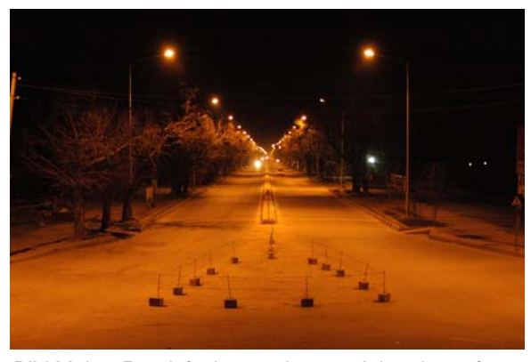
Bibi Mahro Road, facing north toward the airport from Massoud Circle near the U.S. Embassy, is now complete. The road was turned over to the municipality in mid-April 2006.

Jalalabad-Asmar Road (124 km)—Road crushers at km 37 and km 66 operate ten to 18 hours daily producing subbase and base material. The construction of stone masonry side drains continues at 11 locations. Work on two causeways at km 27+450 and 27+850 continues. Placement of the first layer of the DBST seal coat is progressing.