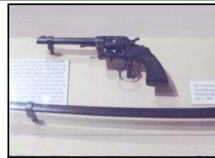
TR's pistol back on display