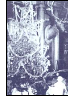
Christmas in the North Room