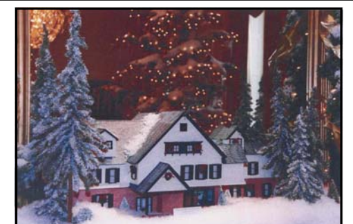
Holiday display of Sagamore Hill in the White House 2001