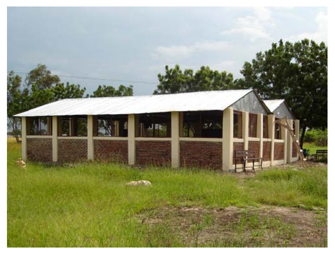
The renovated student center at the University of Upper Nile now hosts lively debates on current events.

Malakal is one of many urban centers in Southern Sudan suffering from a lack of capacity. A government garrison town and site of active militia during the civil