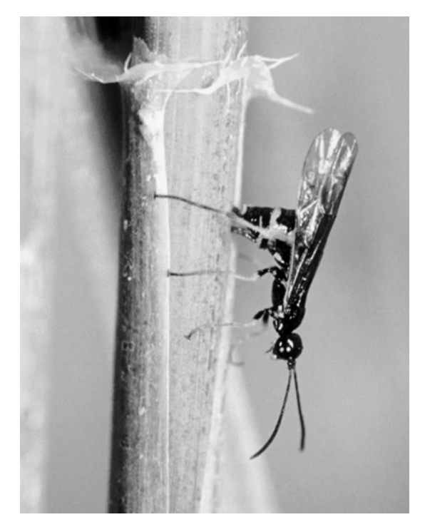
Female wheat stem sawfly laying an egg.

This parasite is new to science and does not yet have a specific name but belongs to the Ichneumonidae family. As far as is known, one or more species of Ichneumonidae attacks each species of sawfly, with the exception of the North American wheat stem sawfly. Most of these sawfly species are found in Europe and Asia. No ichneumonid parasite has ever been found attacking Cephus cinctus in North America. This is interesting and suggests that there may be a niche available for another natural enemy. Much work needs to be done before these ideas can be verified.