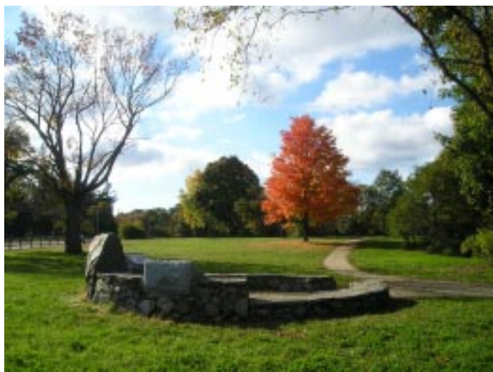
Paul Revere Capture Site, Rt 2A, Lincoln

The Colonists who fought for their rights along Battle Road on April 19, 1775 are central to our nation's history and to the principles on which our country was founded. Battle Road was the scene of the historic resistance to colonial rule that led to the birth of our nation and the spread of democratic government throughout the world. The designation of the Scenic Byway will help to preserve this historic setting and educate Americans and visitors from around the globe about the ideals of citizen responsibility.