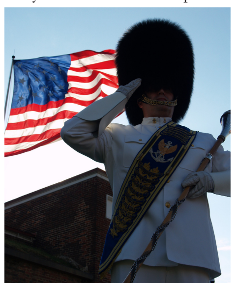
Navy Band Drum Major, 2008

The trill of fifes, the beat of the drum, the patriotic fervor and vigor of military bands, the precision of silent drill teams performing feats of skill and balance - rifles seem to fly above their heads in perfect