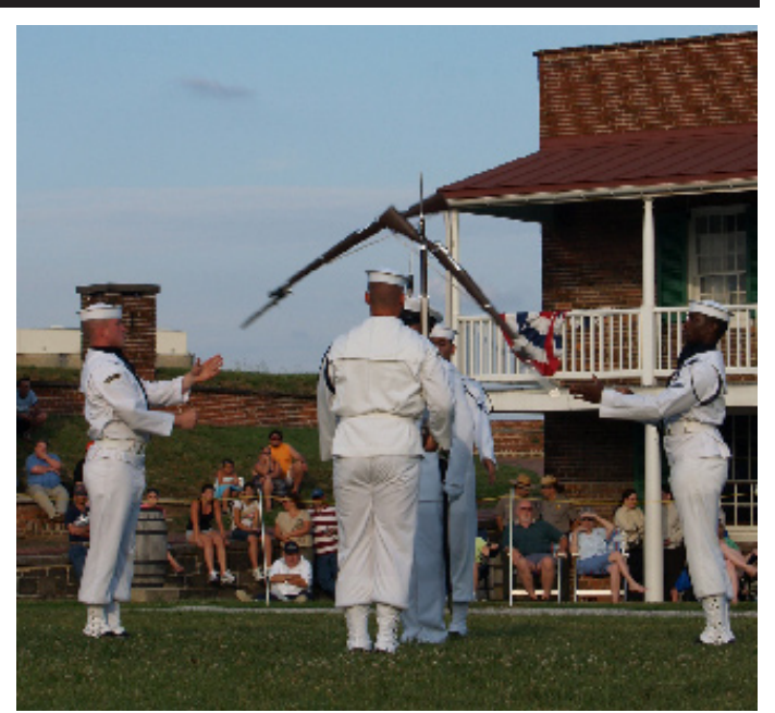
Rifles fly with grace and precision at the June 29 Navy Tattoo