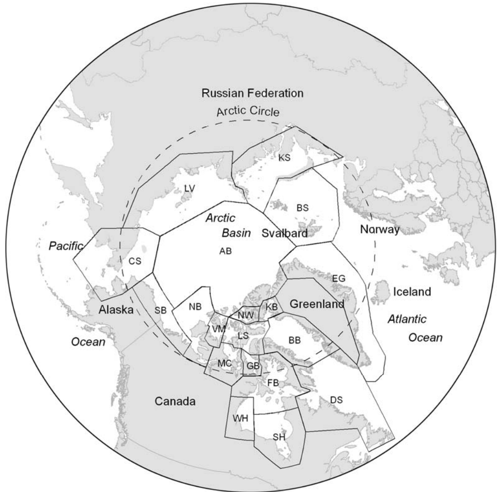
Figure 1. Distribution of Polar Bear Populations Throughout the Arctic Circumpolar Basin

Legend: CS = Chukchi Sea; SB = Southern Beaufort Sea; NB = Northern Beaufort Sea; VM = Viscount Melville Sound, NW = Norwegian Bay; LS = Lancaster Sound; MC = M'Clintock Channel; GB = Gulf of Boothia; FB = Foxe Basin; WH = Western Hudson Bay; SH = Southern Hudson Bay; KB = Kane Basin; BB = Baffin Bay; DS = Davis Strait; EG = East Greenland; BS = Barents Sea; KS = Kara Sea; LV = Laptev Sea; AB = Arctic Basin