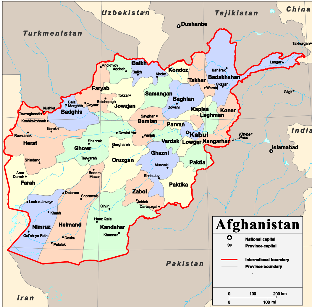
Figure 1. Afghanistan

© MAGELLAN Geographix SM edited by CRS 04/02