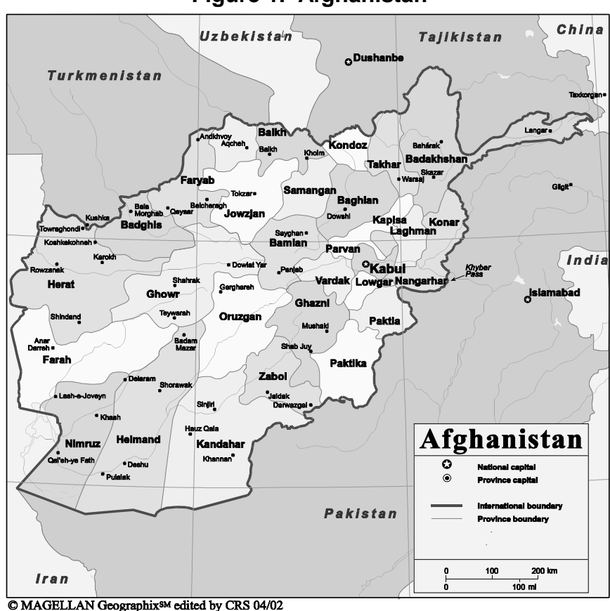
Figure 1. Afghanistan

The U.S.-led effort to end permanently Afghanistan's role as a base for antiwestern Islamic terrorists requires not only the defeat of the Taliban—which has been achieved through American, allied, and Afghan military action, but also the reconstruction of a stable, effective and ideologically moderate Afghan state. Otherwise, the country could again become a base for terrorism. Additionally, unless some means is found to organize a relatively stable, multi-ethnic society, the current sharp divisions between the Pushtuns in the South and the Tajiks, Uzbeks, and Hazaras in the North, West, and central Hazarajat region, are likely to have wider repercussions for the stability of Pakistan and the Central Asian states.