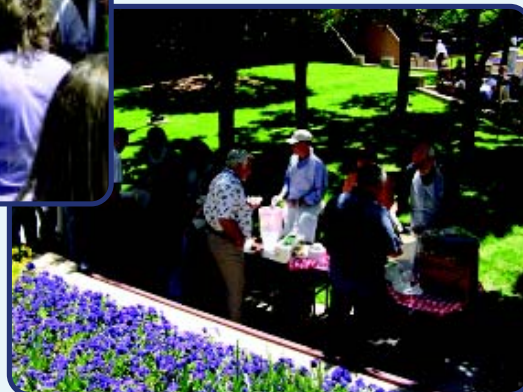
Management served ice cream for dessert.