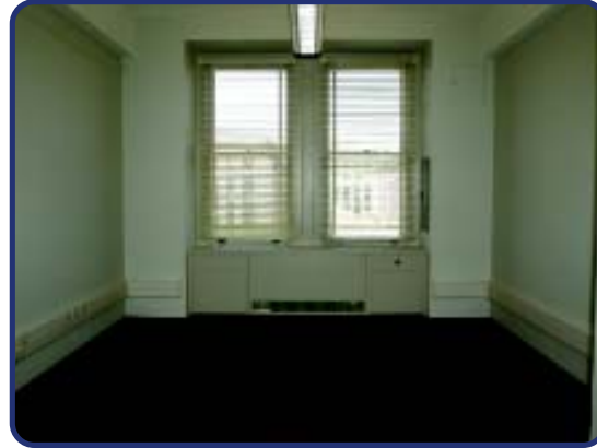
Sustainable features of renovated 6th wing office – peel and stick carpet, pendent lighting, occupant controlled heating and cooling fan coil units.

Recycling is not only the responsibility of the occupants. Contractors working in the building are required to follow recycling guidelines and to recycle construction debris that leaves the building. In addition, the Modernization Office is working with the Facilities Management to identify light