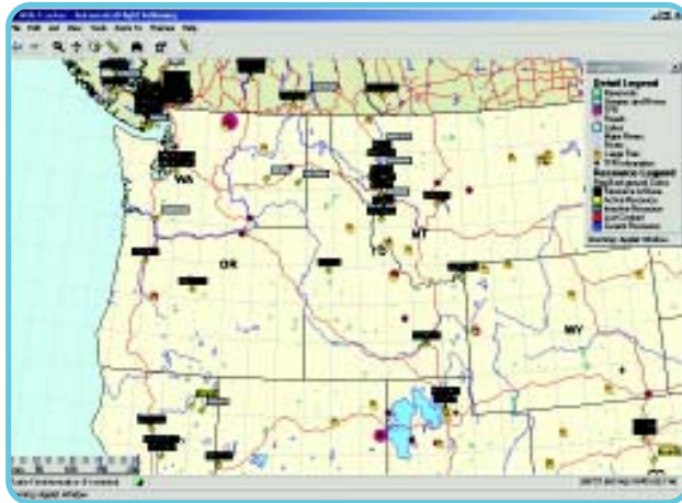
This image of Webtracker indicates large fire locations, temporary flight restrictions and aircraft locations. Additional views and information can be requested by the user.

For the past two years, the AM has partnered with the U. S. Forest Service (USFS) in the creation of a developmental “Automated Flight Following” (AFF) system. Providing aviation managers and dispatchers with information regarding the specific location of all government-owned and contracted aircraft is the expressed goal of this partnership. While the primary purpose of such a system is for timely search and rescue of injured persons, the transmission of data and voice between the aircraft and the ground dispatcher can realize significant improvements in efficiency. In addition, this system provides invaluable data for accident investigators and may mitigate some homeland