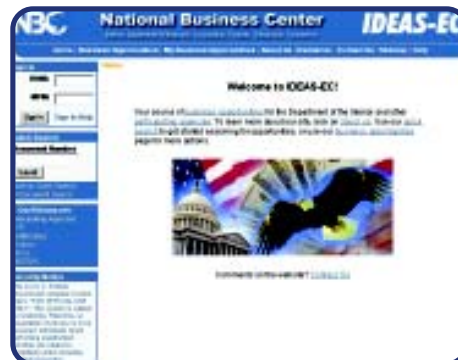
The new EC website can be viewed at http://ideasec.nbc.gov

vendors will now be able to add multiple contacts on bidder's mailing lists. The system was also revised to ensure compliance with the Section 508 disability requirements and was given high praise by the 508 Compliance Coordi-