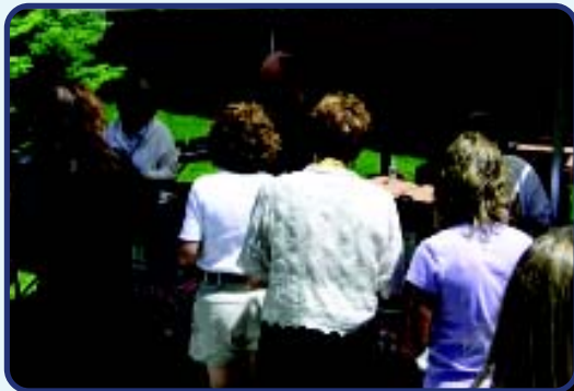
Lunch was served in the picnic area after the award ceremony.