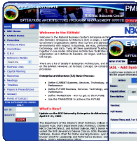
NBC Enterprise Architecture Web resources: EAWeb (left) and EASL (bottom).