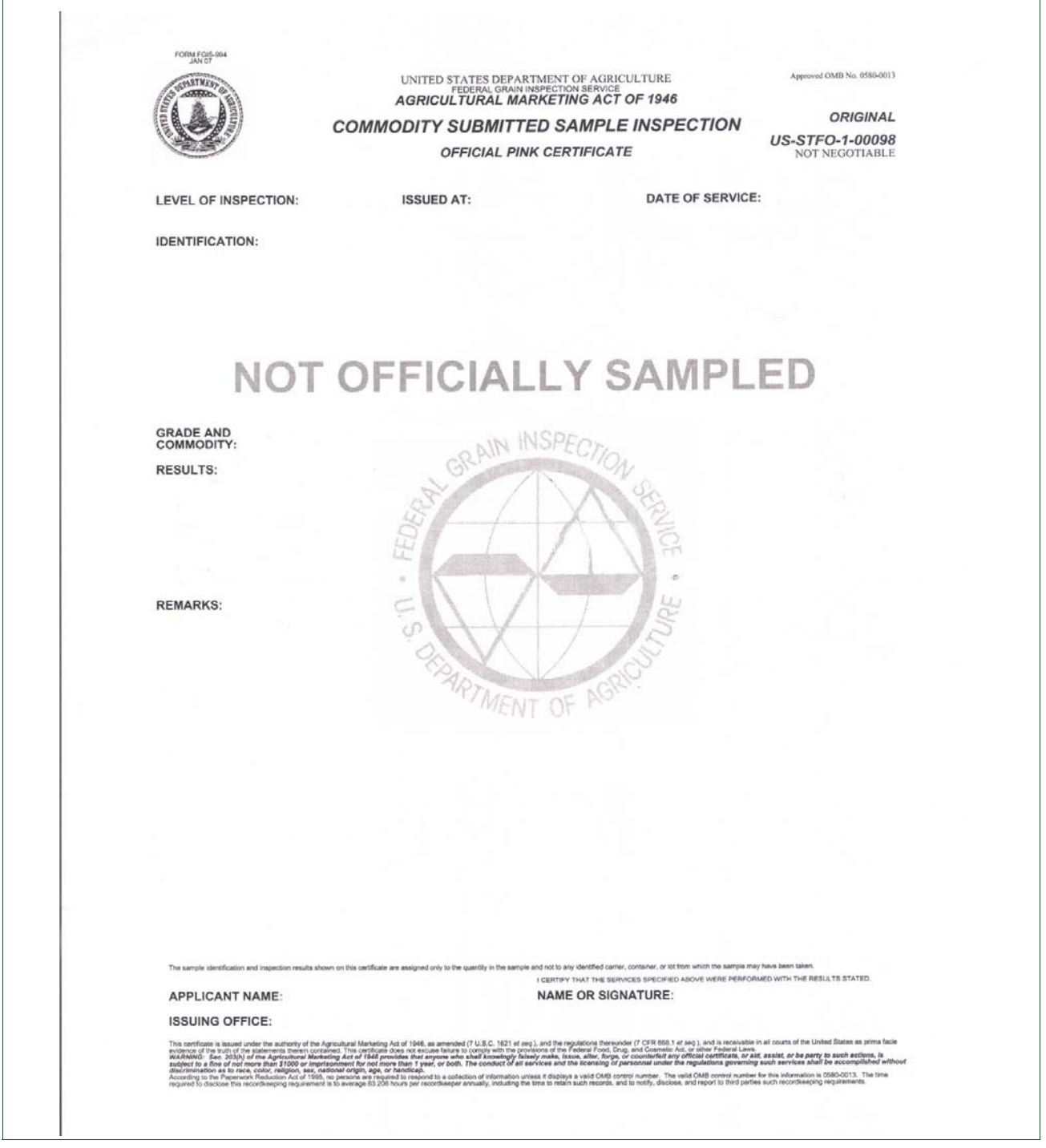
FIGURE A-1-21: Example of FGIS Form 994 (Jan 07), Commodity Submitted Sample Inspection (Unacceptable)

FGIS Form 994, Commodity Submitted Sample Inspection, is unacceptable ( not accepted) in place of inspection. This form is used for sampling commodities such as beans, hops, lentils, and peas. See Figure A-1-21 for an example of FGIS Form 994.