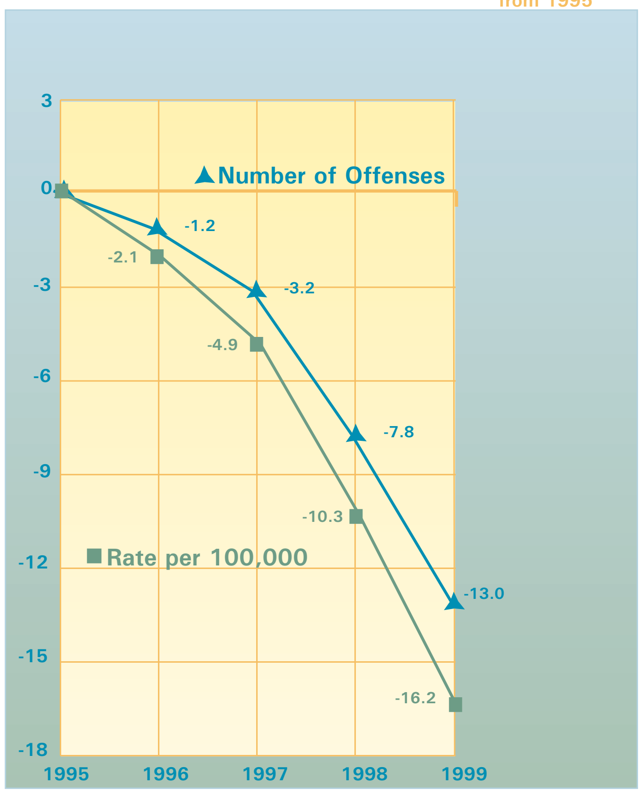
Figure 2.15 Larceny-theft Percent Change from 1995