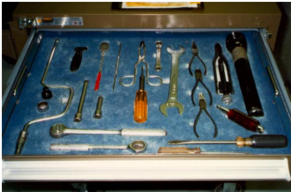
Figure 1: Composite Tool Box at Langley Air Force Base Illustrating the Cut Out Silhouette for Each Tool

Executive agencies are required to establish and maintain systems of internal controls that provide reasonable assurance that resource use is consistent with applicable laws, regulations, and policies; resources are safeguarded to prevent waste, loss, and misuse; transactions and other events are adequately documented and fairly disclosed; and resources are accounted for. With regard to hand tools, basic internal controls should include prior authorization of specific tool purchases by an individual knowledgeable of a unit's tool needs; independent checks to ensure that tool purchases are properly received; and accurate inventory records to reflect tool receipts, issues, and on-hand quantities.