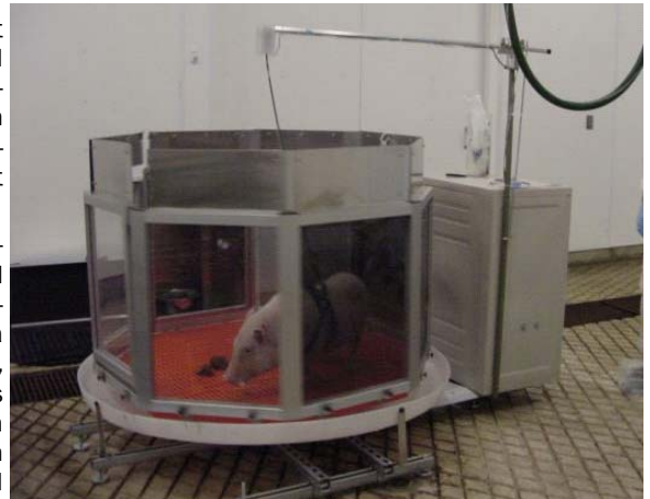
A Gottingen minipig undergoing behavioral testing in the movement responsive PigTurn® prototype