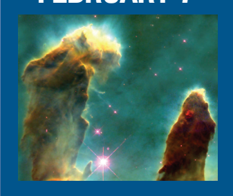
ORDER FROM CHAOS: The Birth of the Solar System