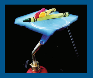
AEROGELS: The Materials Science of Empty Space