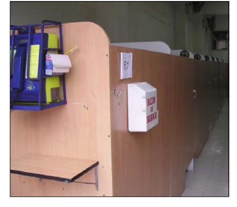
Cabina pública typical booths

Cabinas are characterized by their low prices—an average of 15–30 cents (US) per hour—and relatively efficient connectivity. The cabinas are the result of thousands of commercial initiatives of small informal entrepreneurs. They offer other services such as faxing, scanning, printing, photocopying, text editing, CD/DVD-writing, long-