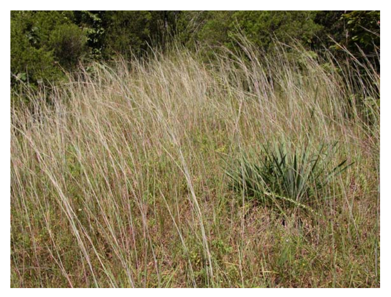
Fig. 1. Big bluestem (Andropogon gerardii) in cedar barren habitat.