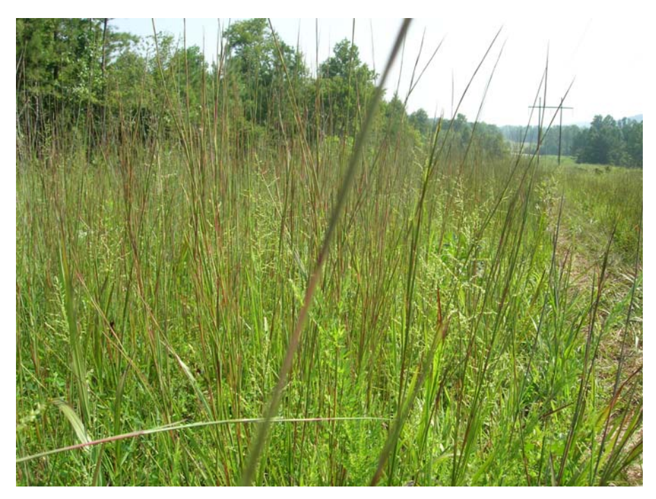
Fig. 4. Little bluestem (Schizachyrium scoparium) along power line right-of-way.

scoparium , Fig. 4), and sideoats grama ( Bouteloua curtipendula ). The first four species in this list are "tall" grasses, ranging from approximately 3 to 8 ft (1 to 2.4 m) in height and are typical components of the Tall or Mixed Grass Prairies. Little bluestem and sideoats grama grow from 2 to 4 ft (0.6 to 1.2 m) tall and occur in the Short and Mixed Grass Prairies (Brown 1979).