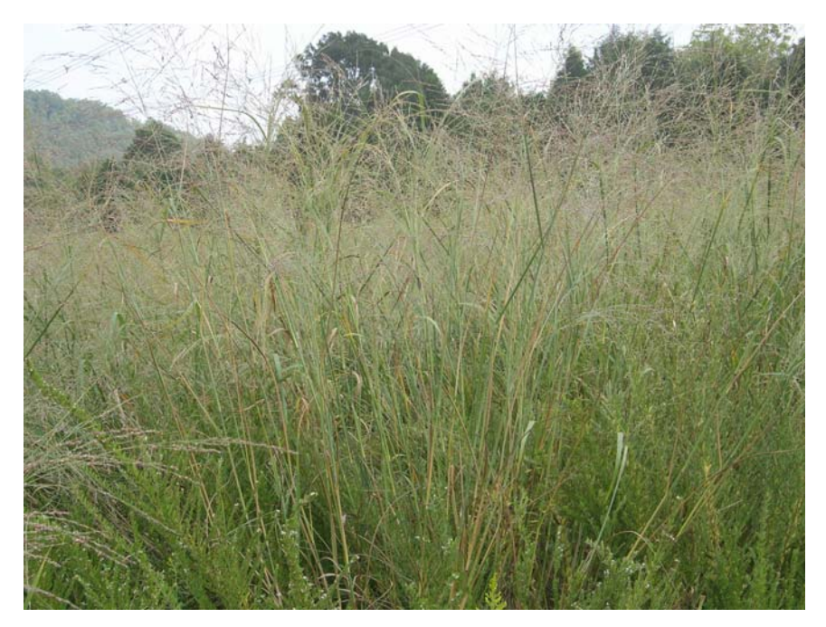
Fig. 3. Switch grass (Pancium virgatum) showing seed heads.

scoparium , Fig. 4), and sideoats grama ( Bouteloua curtipendula ). The first four species in this list are "tall" grasses, ranging from approximately 3 to 8 ft (1 to 2.4 m) in height and are typical components of the Tall or Mixed Grass Prairies. Little bluestem and sideoats grama grow from 2 to 4 ft (0.6 to 1.2 m) tall and occur in the Short and Mixed Grass Prairies (Brown 1979).