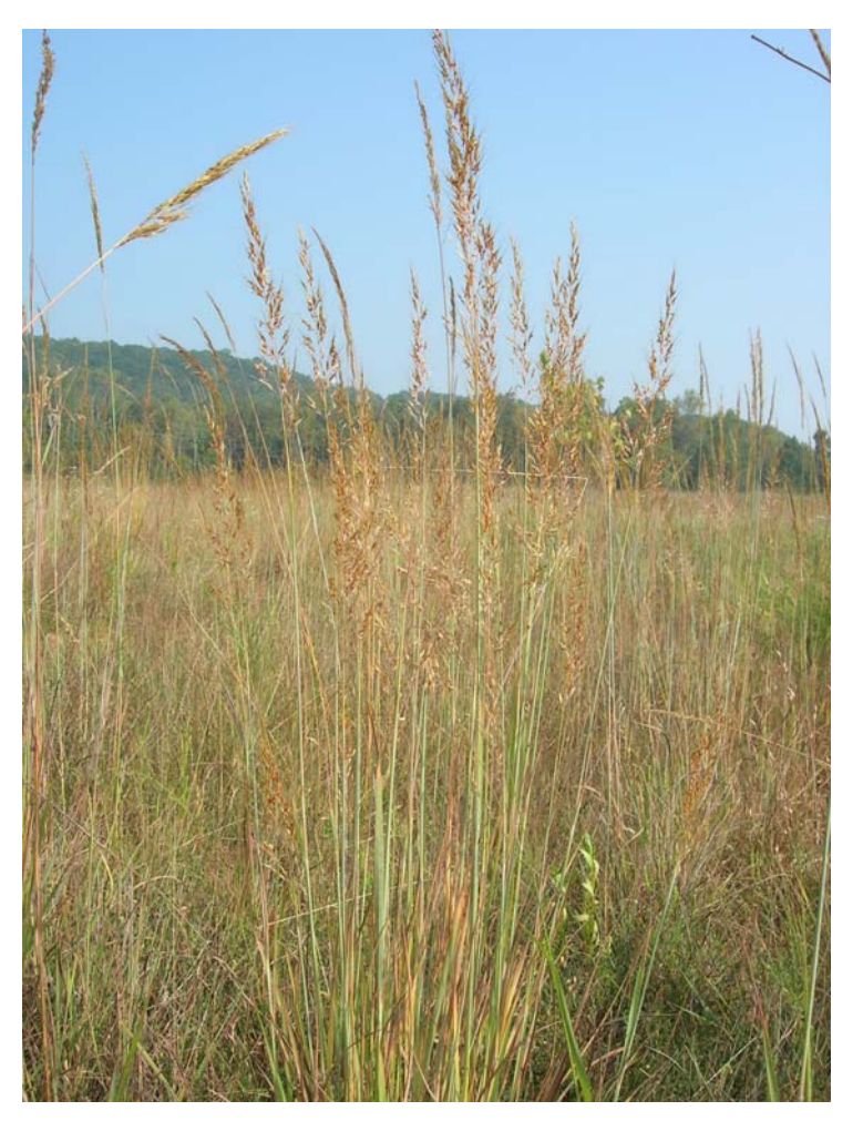
Fig. 2. Indian grass (Sorghastrum nutans) showing seed heads.