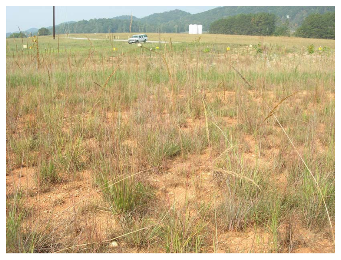
Fig. 5. Warm-season grassland with open spaces between bunches of grasses.

In contrast to native grasslands, fescue fields have limited wildlife benefits. The dense, matted structure of tall fescue stands fails to provide cover, and the lack of bare ground prevents the easy movement, foraging, and nesting of animals in a field (Barnes et al. 1995). Tall fescue and other nonnative grasses often spread quickly, forming monocultures wherever they are planted. Tall fescue is often considered a nonnative invasive species (Miller 2003). Another drawback to planting tall fescue is an endophytic (i.e., living within the tissues of the grass) fungus ( Neotyphodium coenophialum ) that infects 97% of all tall fescue fields. (Native grasses are not susceptible to the fungus.) This fungus, although beneficial to the grass (infected fescue plants are more vigorous, more drought-resistant, and better tolerate poor soils), is toxic to herbivores (Bacon and Siegel 1988). Infected fescue is detrimental to wildlife because the endophyte produces alkaloids that are toxic to many species. Tall fescue seeds are also known to have potentially harmful effects on northern bobwhite, some songbirds, and Canada geese ( Branta canadensis ). Many bird species have been shown to eat fescue seeds only as a last resort when other foods are offered (Conover and Messmer 1996). Some species might alter feeding habits in the wild to avoid fescue (Clay and Holah 1999).