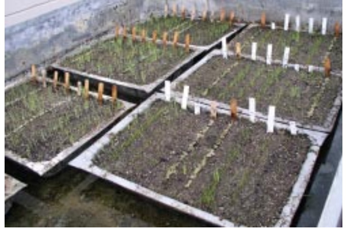
Figure 4. Artificial wetland tank with greenhouse flats.

for Carex and 0.05 g seeds per row for Juncus providing approximately 185 Carex and 770 Juncus seeds per row. Seeds in the drilled and surface-pressed rows were then pressed into the soil using the imprinting jig to provide good seed-to-soil contact. Drilled rows were then covered with approximately 6 mm (0.25 in) of soil mix that was lightly pressed into the rows by hand. Tackifier treatments were applied as a tackifier-seed slurry using 0.05 g Turbo Tack High Performance Tackifier (Turbo Turf 2004) in 125 ml water with 0.80 g Carex seeds or 0.40 g Juncus seeds. The slurry was well agitated in a beaker and poured into the rows by hand. When poured over the 8 replicates this provided approximately the same seed rate as the drilled and surface-pressed treatments. Submerseed pellets were planted by hand at 20 pellets per row. With approximately 2 Carex seeds or 5 Juncus seeds per pellet, this provided about 40 Carex or 100 Juncus seeds per row.