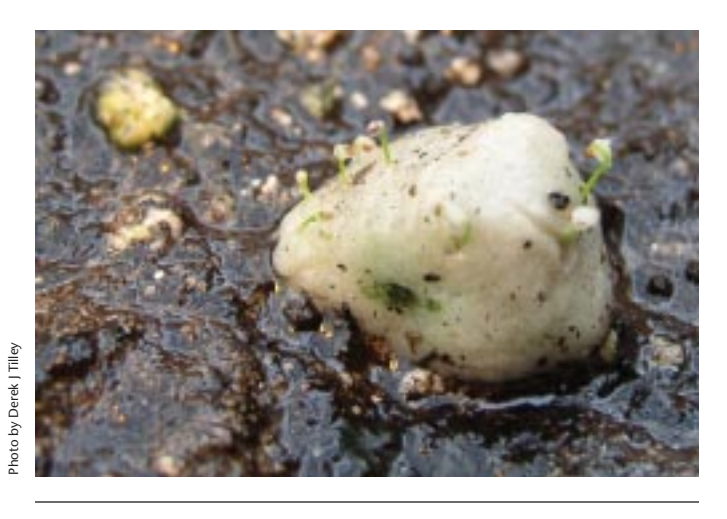
Figure 3. Submerseed<sup>™</sup> particle with Juncus seedlings (6 d after planting).

New technologies have been developed that may be adapted to the problems faced in direct seeding of wetlands. Tackifiers commonly used for hydroseeding are available to glue seeds to soil. Another product, Submerseed<sup>™</sup> from Aquablok Industries (Toledo, Ohio), involves binding seeds with clay or clay-sized material and organic polymers to a dense aggregate core (Figure 2). These aggregates absorb water and sink, preventing seeds from floating to the surface (Krauss 2004; Submerseed 2005).