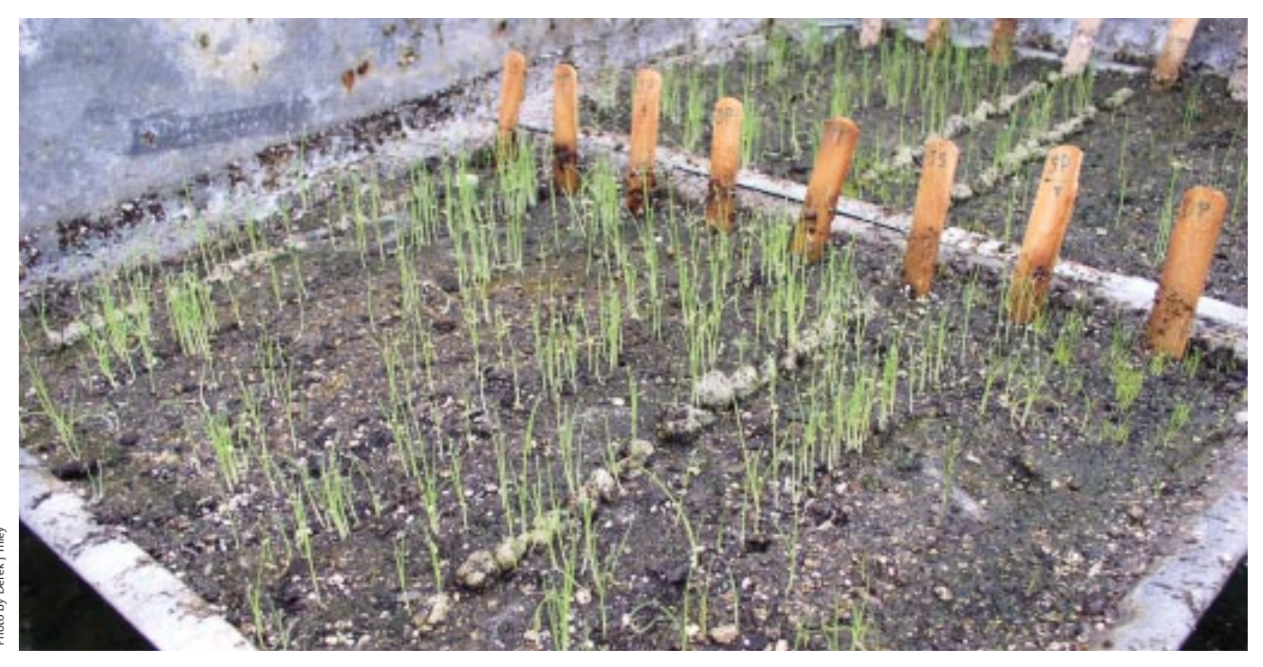
Figure 5. Greenhouse flat with rows of Carex seedlings.

<sup>Z</sup> Means followed by the same letter are not significantly different. P \leq 0.05