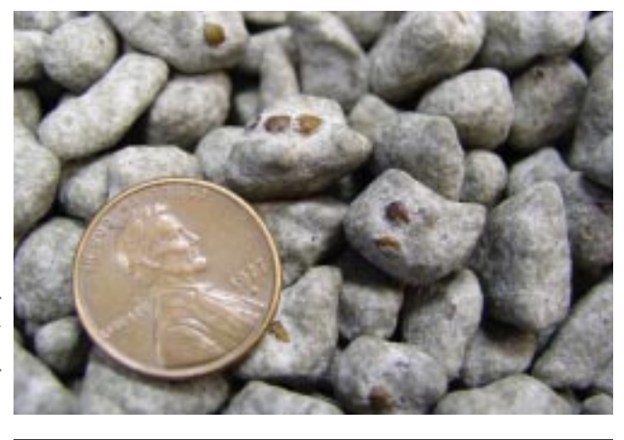
Figure 2. Submerseed<sup>™</sup> particles incorporated with alkali bulrush seeds.