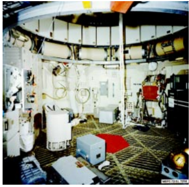
The interior of the Skylab orbital workshop.