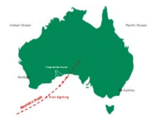
Skylab's final flight path as it disintegrated on reentry.