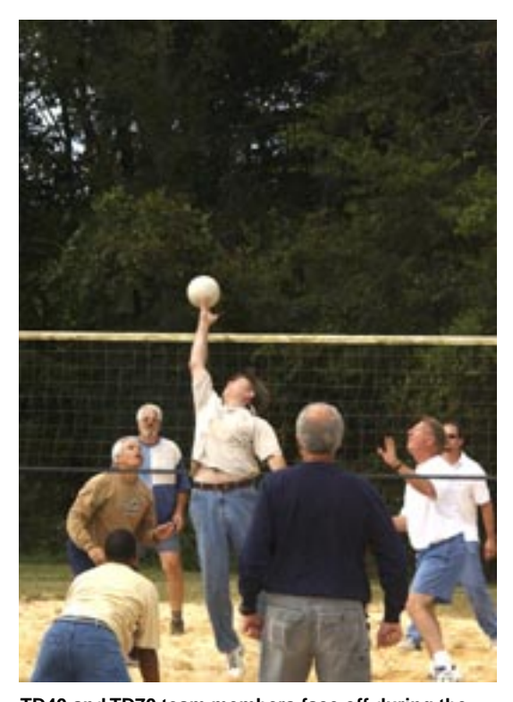
TD40 and TD70 team members face off during the final volleyball match. TD70 won.