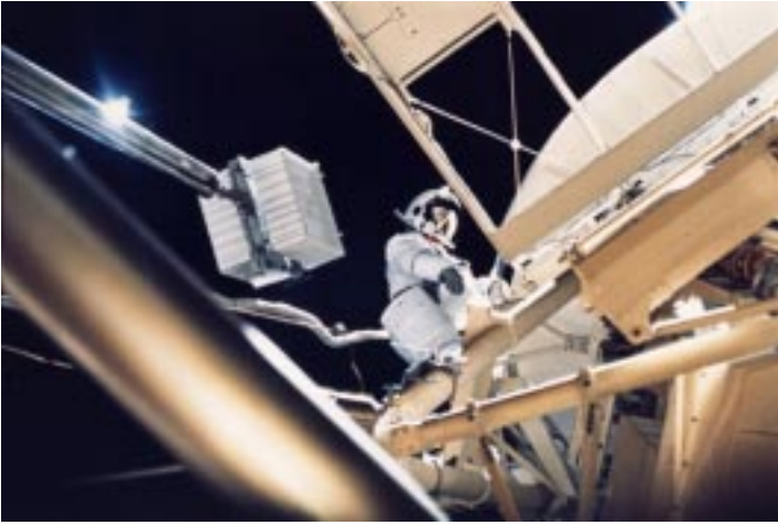
Astronaut Owen Garriott retrieves film during an extra-vehicular activity outside of Skylab on July 28, 1973.

• Joe Kerwin, commenting on the weightlessness of space: "If you go from one module into the other and you're