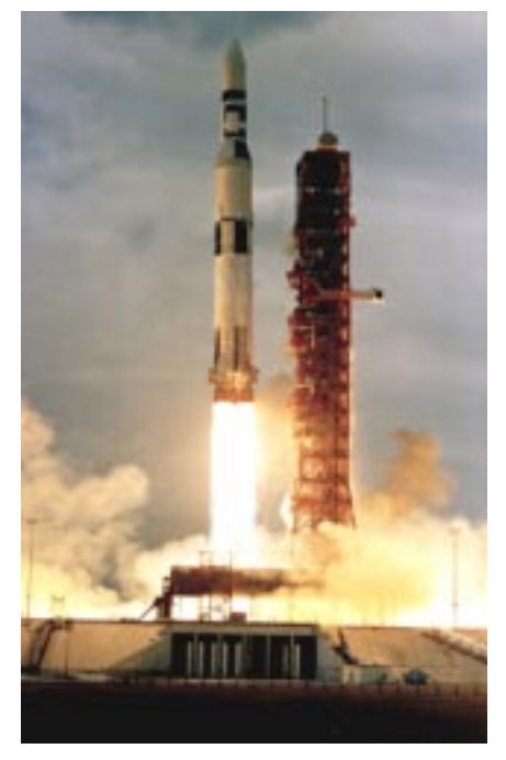
A modified Saturn V lifts Skylab toward the heavens on May 14, 1973.

crew to Skylab on May 15 using a Saturn IB rocket. Faced with the crisis of how to fix the station so that it would be habitable, NASA put the crew launch on hold. It was May 25 when Skylab's first crew went into space and conducted repairs to the station. They returned home on June 22.