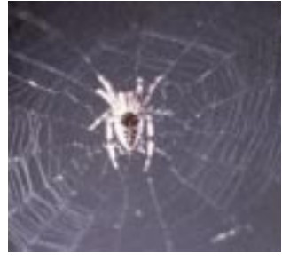
"Arabella," or "Anita," spinning a web on Skylab

Spiders can live about three weeks without food but need plenty of water. Prior to launch, each spider was fed a housefly, and had a water supply next to their specially constructed cage.