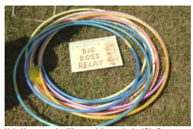
Hula-Hoops await willing participants in the "Big Boss Relay"