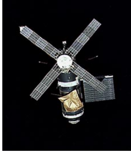
Skylab in orbit with its solar shield in place and solar array fully deployed.