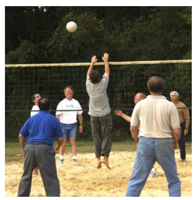
Eyes are on the ball during the final match of the day.