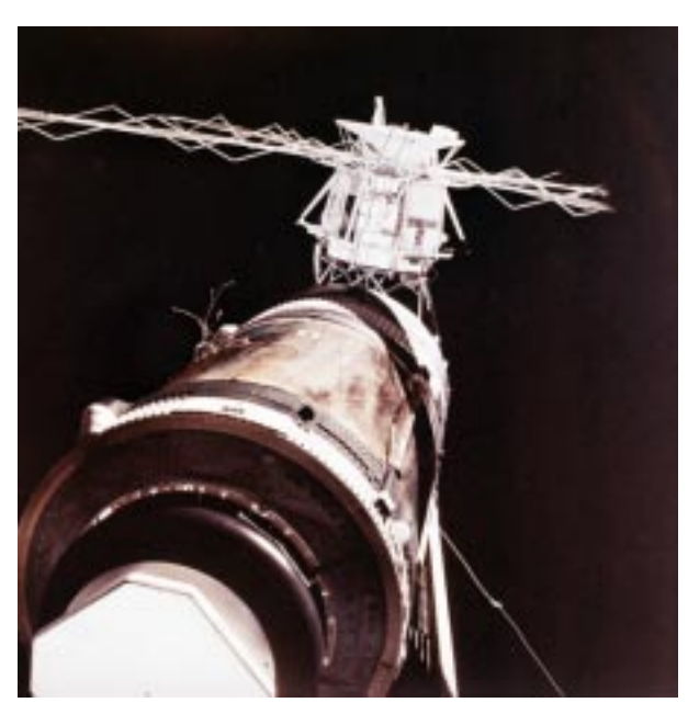
A crippled Skylab in orbit with its heat shield gone, one solar wing gone, and the other solar wing not deployed.

Ed Gibson, center, in the astronaut suit, practices a "space walk" on a mockup of the Apollo Telescope Mount on Skylab in the Marshall Center's Neutral Buoyancy Simulator in 1970.