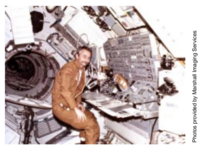
Astronaut Owen Garriott at the control and display planel onboard Skylab's orbital workshop.

Marshall Center celebrates 30th anniversary of Skylab