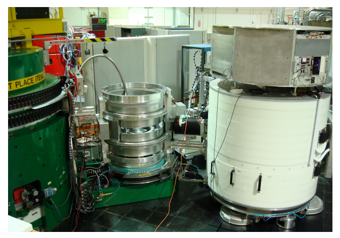
Fig. 1. (Color online) Polarized beam setup on the BT-7 Triple Axis Spectrometer. The <sup>3</sup>He polarizer is located between the monochromator drum (green) and the sample enclosure and the <sup>3</sup>He analyzer is located between the sample enclosure and the detector (white). Homogeneous magnetic fields for preserving the <sup>3</sup>He polarization are provided by an end-compensated magic box (polarizer) and a magnetically shielded solenoid (analyzer).