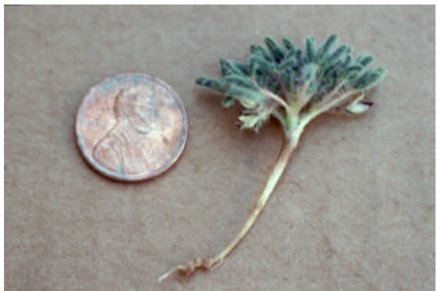
Closeup of Lupinus uncialis