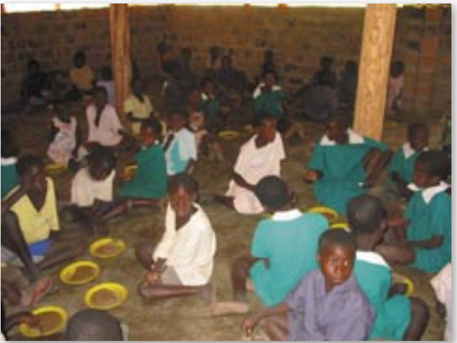
A full stomach allows these young minds also to be filled

Toticeably hotter and more arid, WFP's projects in the Southern Province are equally impressive. The Bbakasa Basic School in Siavonga, founded in 1946 by Salvation Army missionaries, had closed and was only re-opened in 1982 after the area was cleared of land mines. Today, with the support of the GRZ's Ministry of Education and WFP, more than 250 children are enrolled through grade 4.