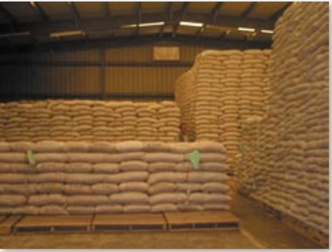
Stacked in defense against hunger

of maize, beans and other commodities as well as 60,000 Humanitarian Daily Rations (HDRs) donated by the US Department of Defense for repatriating Angolan refugees.