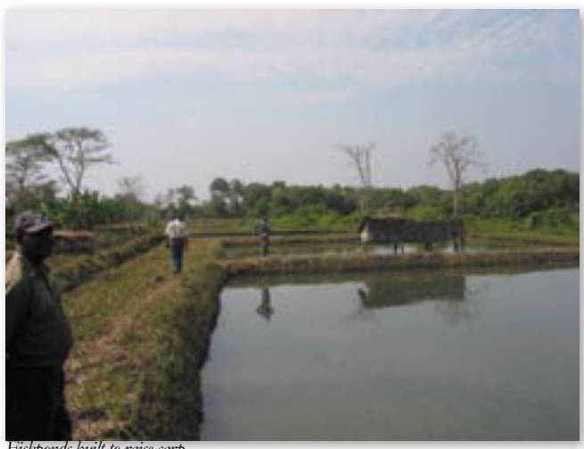
Fishponds built to raise carp

Lutheran World Federation (LWF) is WFP's principal implementing partner at the Meheba refugee camp. Along with other NGOs, LWF has developed impressive asset creation and preservation activities such as community gardens, fish farming, shoe repair, and sewing enterprises.