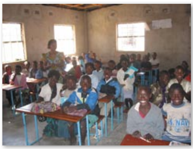
A Bethany classroom

In addition to classroom training, Bethany's skills training center in tailoring, shoe making and repair provides income-generating opportunities.