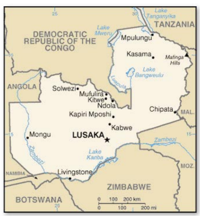
The Republic of Zambia

Zambians are predominantly Christian. The Roman Catholic Church is the largest single denomination, but Anglicans, Baptists, Methodists, and others are well established. The growth of fundamentalist churches has been particularly noticeable since independence. The small Asian community is predominantly Hindu.